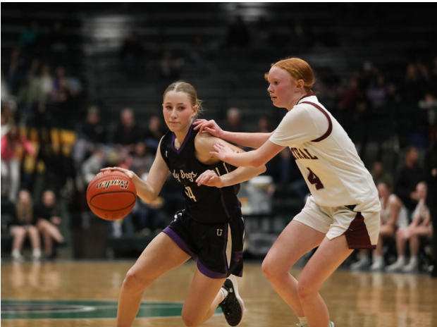
LOU MASON, FOR 406 MT SPORTS

Butte High leads series 39-18 2024-25: Butte 58, Central 16 2024: Butte 52, Central 26 2023: Butte 63, Central 32 2021: Butte 52, Central 40 2019: Butte 57, Central 40 2018: Butte 57, Central 51 2017: Central 57, Butte 32 2016: Central 47, Butte 40 2015: Central 56, Butte 38