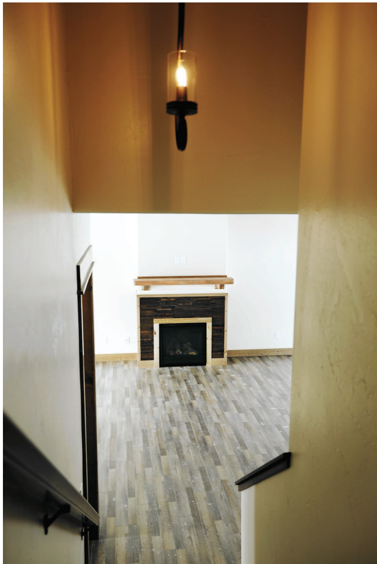
A view from the second story looking into the living room of Bill Roylance's newly constructed home on Tipi Trail.

Roylance finished the house about a month ago. It is blessedly quiet inside, with no traffic noise at all. The views are spectacular — northward,