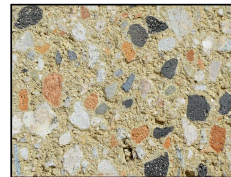
HONED CMU 825 SAGE, STANDARD COLOR (GF)