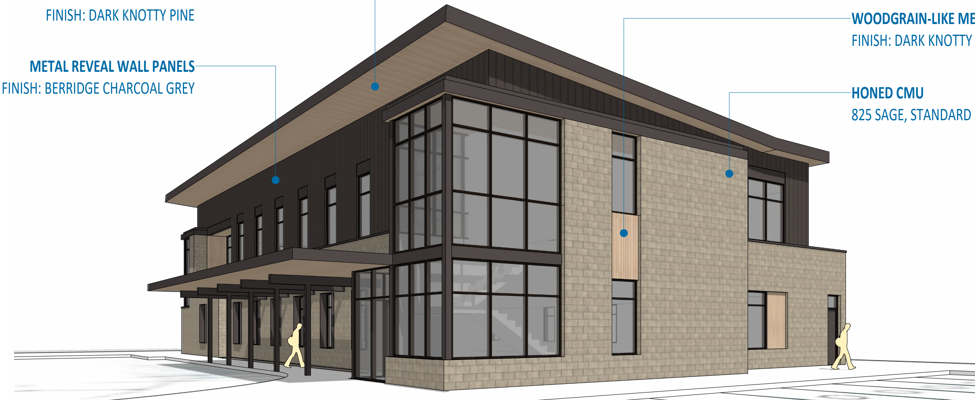
3D VIEW AT MAIN ENTRY - SE