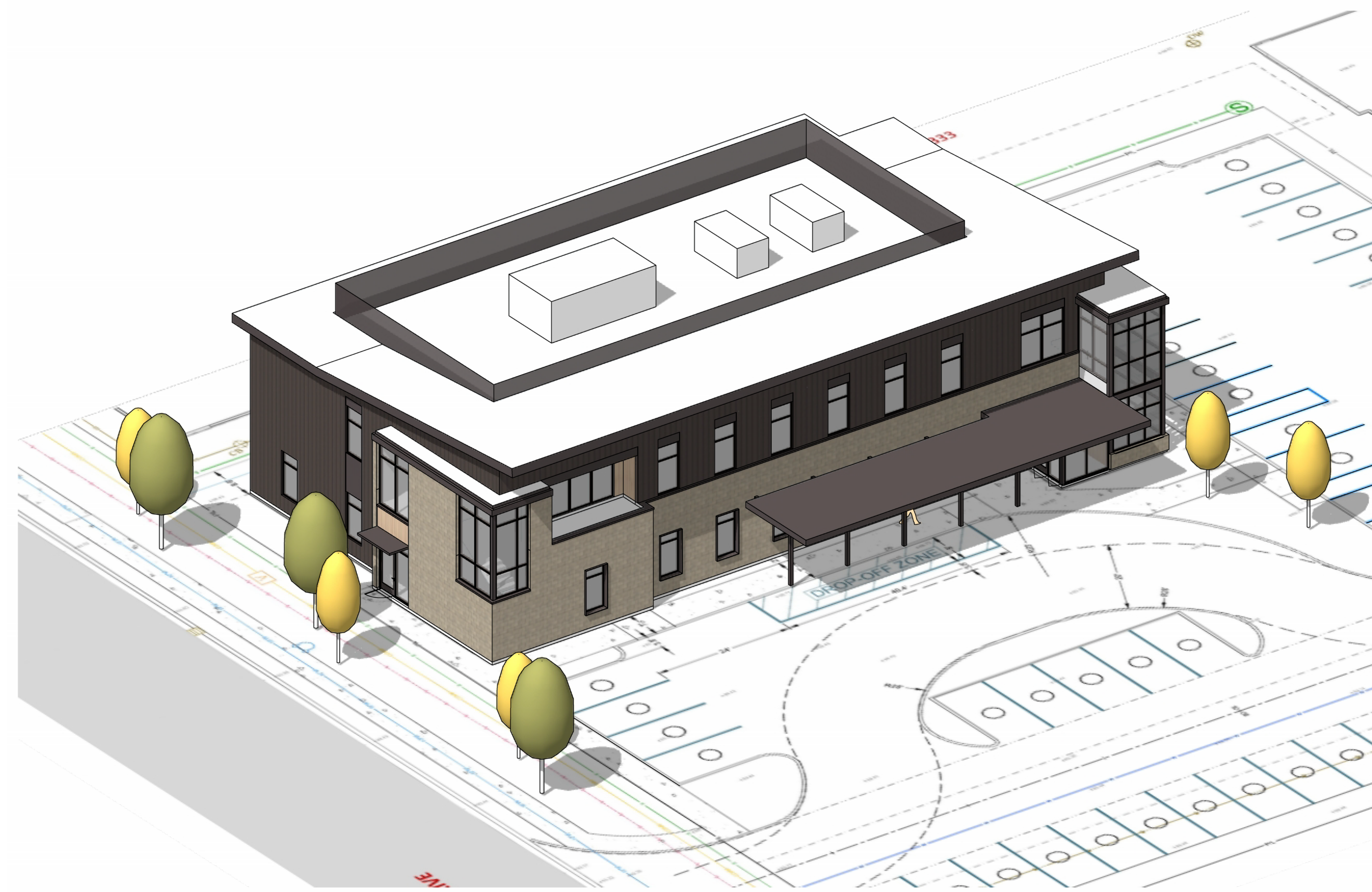
OVERALL 3D VIEW