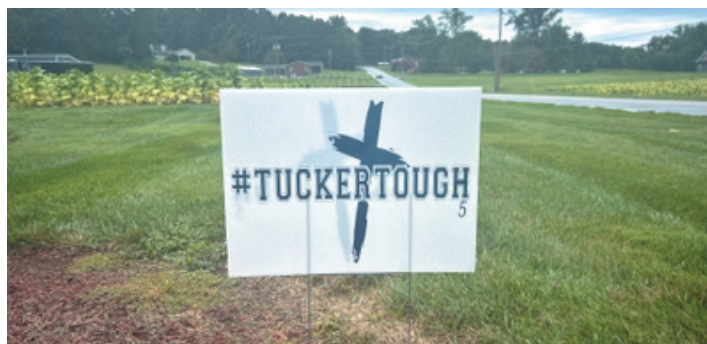
TuckerTough yard sign