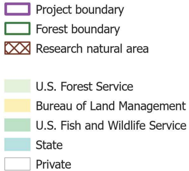
Figure 1-1 Project Overview