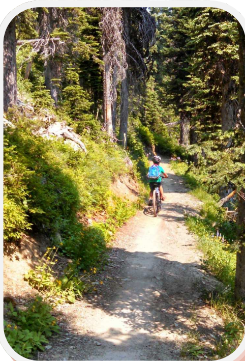
Photo: Mountain Biker on Trail

This proposed action complies with the 2015 Kootenai National Forest Plan. In that plan, this area has several overlapping management areas (MA). The plan states that the direction for MA1c takes precedence for those areas within the MA1c boundary. The majority of the remainder of the area is designated as MA5b (Backcountry – Motorized Year Round) with a small portion of MA 5a (Backcountry – Non-motorized Year Round) and a small portion of MA6 (General Forest).