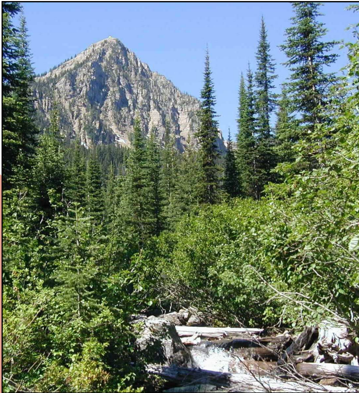
View of Stahl Peak

USDA Forest Service Kootenai National Forest Fortune Ranger District