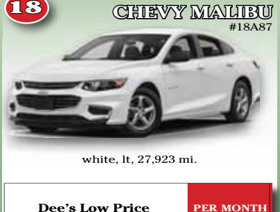
Dee's Low Price $18,998 PER MONTH *232<sup>68</sup>