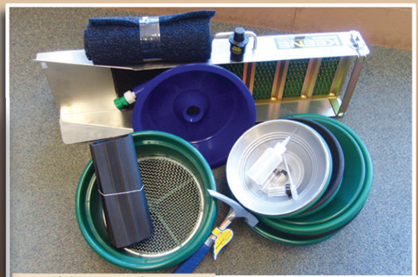
gold pans, sluices