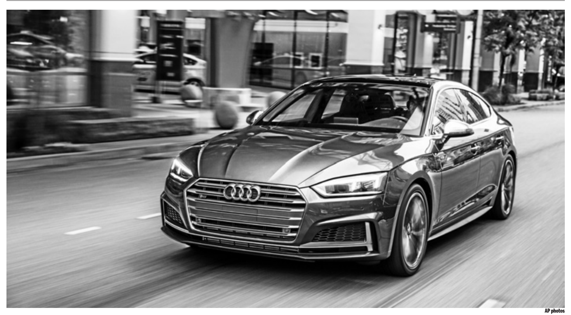
This photo provided by Audi shows the 2018 Audi A5 Sportback, an all-new luxury hatchback based on the A5 coupe and the related A4 sedan. Although the A5 Sportback lacks the commodious cargo area of the Volkswagen or even the Honda, it's still quite handy when you flip the rear seatbacks down. Mainstream brands can't compete with its exquisite fit and finish.