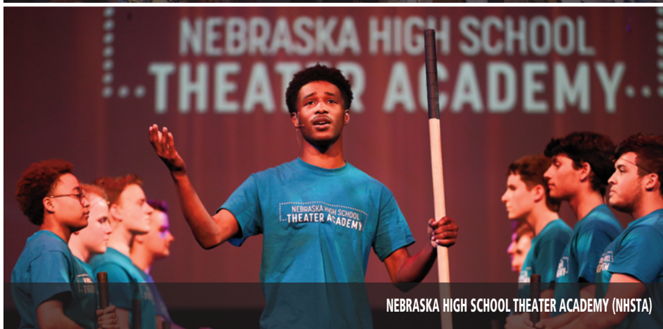
NEBRASKA HIGH SCHOOL THEATER ACADEMY (NHSTA)