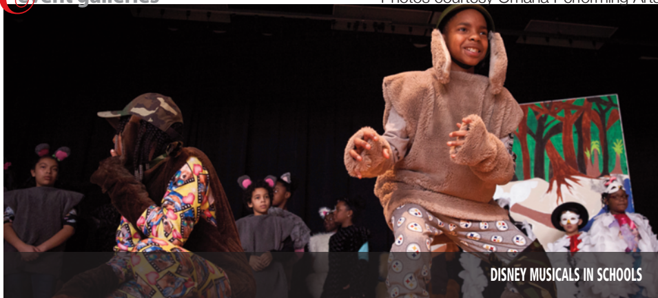
DISNEY MUSICALS IN SCHOOLS