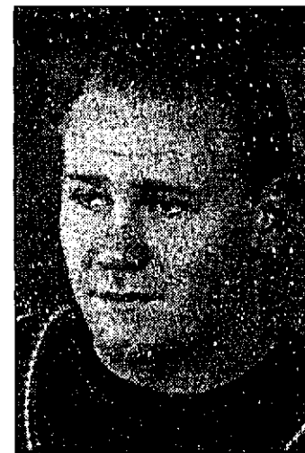
Steve Emtman Soon to be a Colt?