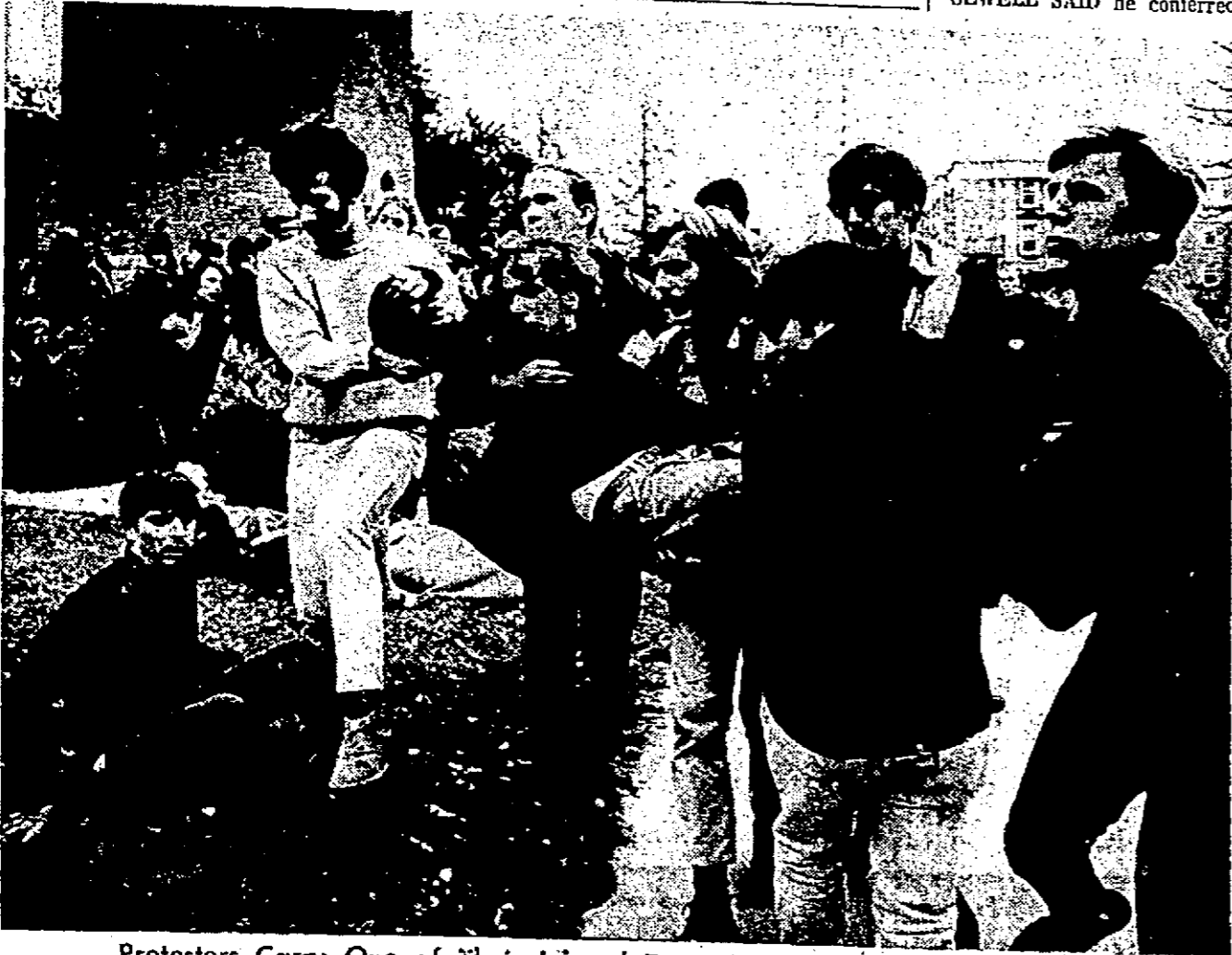
Protesters Carry One of Their Injured From Scene of Clash With Police

Television shows have gotten so bad this season that many kids have gone back to doing their homework.