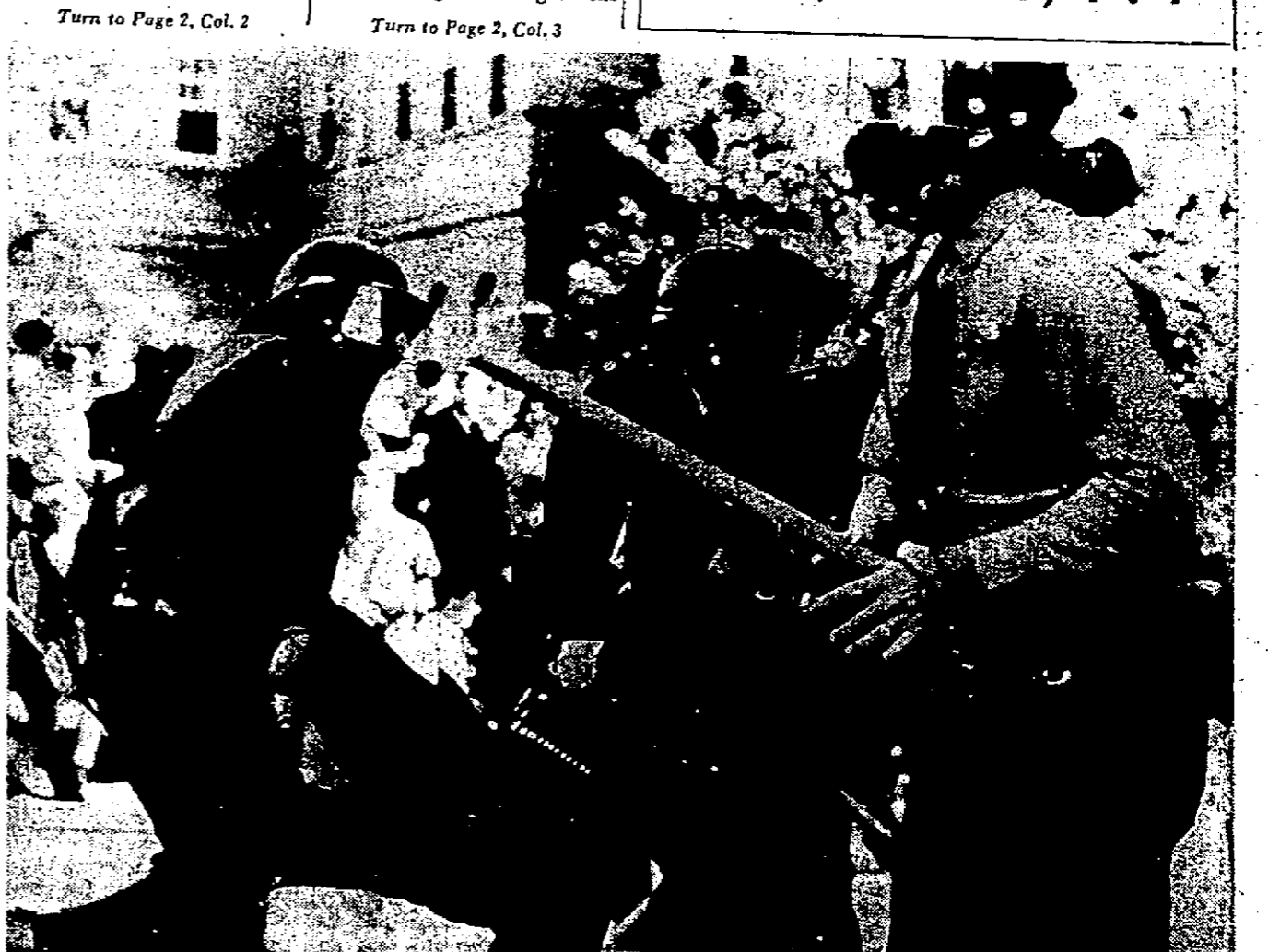
Police Carry One of Their Injured From Scene of Clash With Protesters