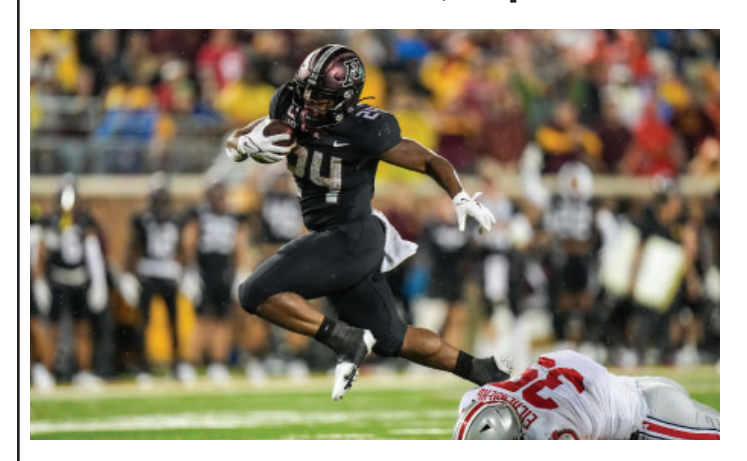
Box Score (Final) The Automated ScoreBook Ohio State vs Minnesota (Sep 02, 2021 at Minneapolis, Minneso)