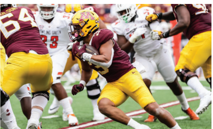
Box Score (Final) The Automated ScoreBook Bowling Green vs Minnesota (Sep 25, 2021 at Minneapolis, Minneso)