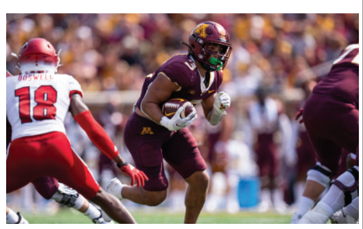
Box Score (Final) The Automated ScoreBook Miami (OH) vs Minnesota (Sep 11, 2021 at Minneapolis, Minneso)