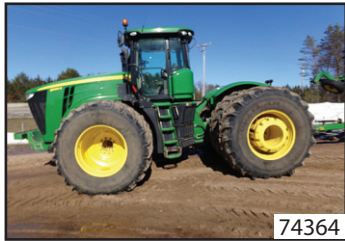
2012 JOHN DEERE 9560R $134,900 (M)