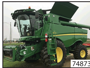
2016 JOHN DEERE S670 $229,900 (M)