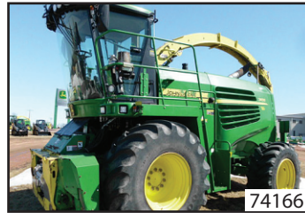
2009 JOHN DEERE 7450 $99,900 (S)