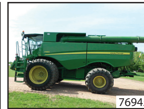
2015 JOHN DEERE S680 $224,900 (S)