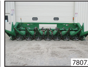
2014 JOHN DEERE 608C $47,995 (S)