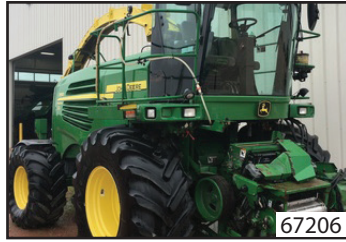
2008 JOHN DEERE 7550 $69,900 (H)