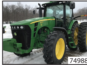
2010 JOHN DEERE 8225R $96,900 (SP)