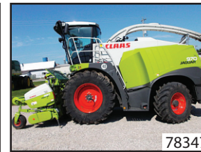
2017 CLAAS 970 $479,985 (CA)