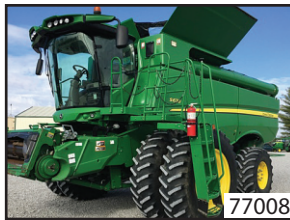
2013 JOHN DEERE S670 $169,900 (PU)