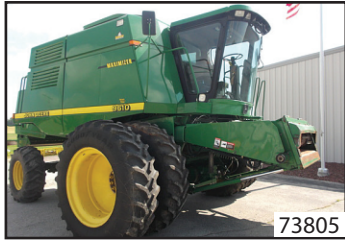
1998 JOHN DEERE 9610 $24,900 (CA)