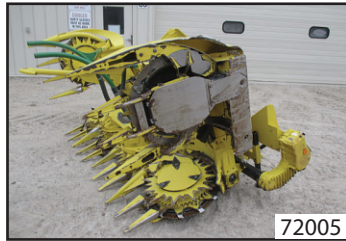
2015 JOHN DEERE 696 $36,900 (CH)