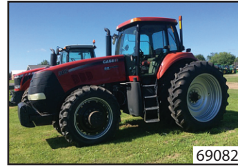
2008 CASE-IH MAGNUM 305 $60,900 (A)