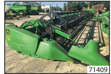
2014 JOHN DEERE 640FD $47,900 (H)