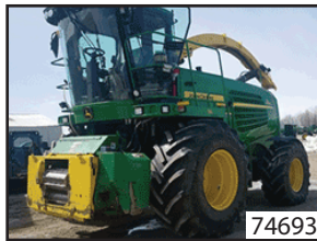
2008 JOHN DEERE 7550 $135,900 (PU)