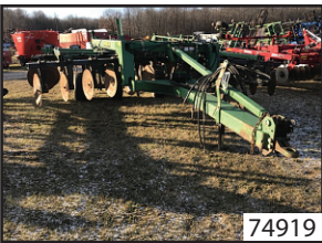
2004 JOHN DEERE 2700 $7,950 (M)