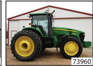
2009 JOHN DEERE 7830 $97,900 (M)