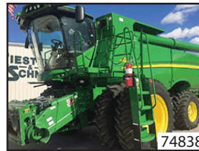
2015 JOHN DEERE S660 $219,900 (CA)