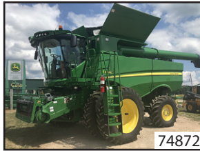
2017 JOHN DEERE S660 $269,900 (M)