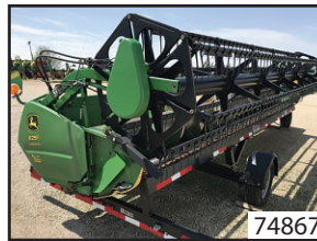
2003 JOHN DEERE 625F $14,995 (PO)