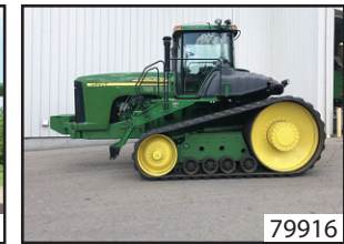
2005 JOHN DEERE 9520T $84,900 (H)