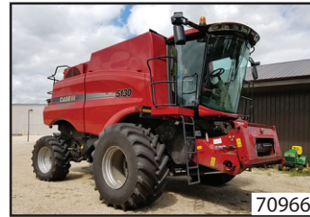
2013 CASE-IH 5130 $139,900 (CA)