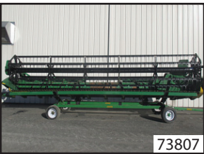
2011 JOHN DEERE 625F $12,900 (CH)