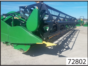
2004 JOHN DEERE 630F $8,650 (PU)