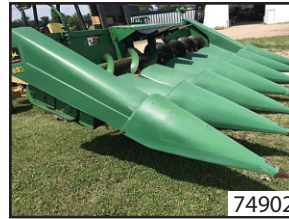
2000 JOHN DEERE 693 $11,995 (SH)