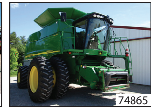
2007 JOHN DEERE 9660 STS $80,900 (PO)

Antigo (A) | Pound (PO) | Pulaski (PU) | Campbellsport (CA) | Chilton (CH) | Neenah (N) | Shawano (SH) Marion (M) | Denmark (D) | Hortonville (H) | Stevens Point (SP) | Westfield (W) | Stratford (S) | Fond du Lac (F)