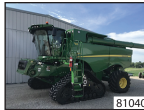
2018 JOHN DEERE S780 $389,900 (CA)