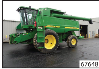
2004 JOHN DEERE 9860 STS $52,900 (D)