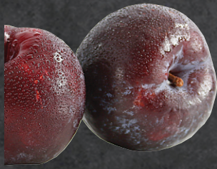
California Red or Black Plums