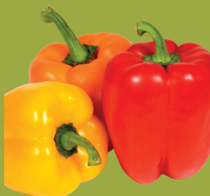
Red, Yellow, or Orange Peppers