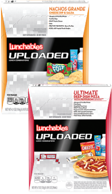
Oscar Mayer Uploaded Lunchables 5-6 oz.