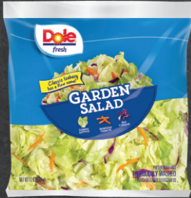
Dole Garden Salad 12 oz.