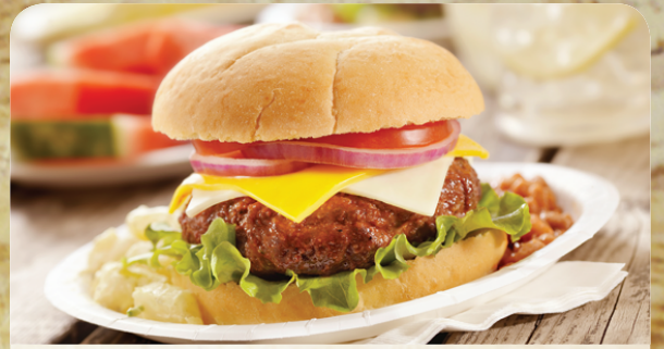
Beyond Meat Beyond Burger 8 oz. plant-based