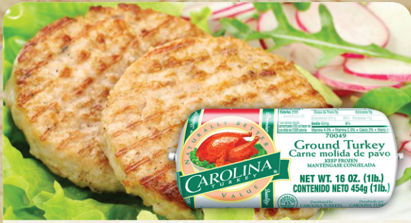
Carolina Ground Turkey 16 oz. frozen