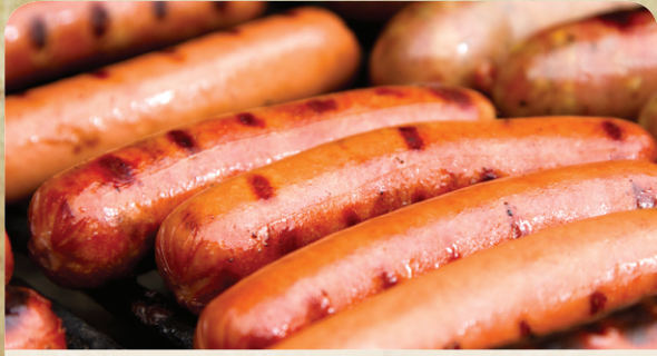
Beyond Meat Bratwurst or Italian Sausage 14 oz. plant-based