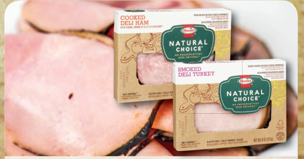
Hormel Natural Choice Lunchmeat assorted varieties 6-8 oz.