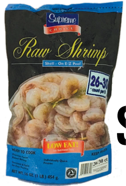
Supreme Choice Raw Shrimp 16 oz. 26/30 ct.