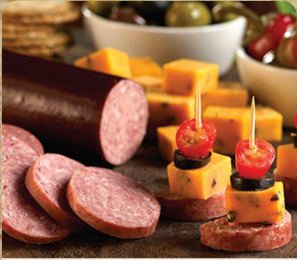
Schweigert Cervelat Summer Sausage 9 oz.