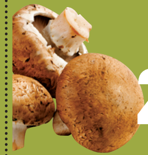
Baby Bella Mushrooms assorted varieties 8 oz.