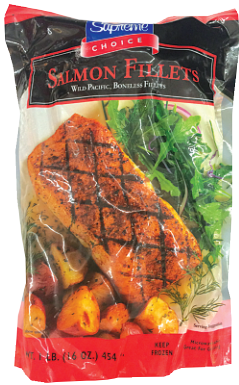
Supreme Choice Salmon Fillets 16 oz.