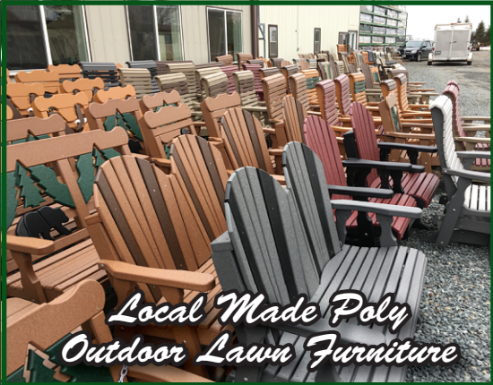
Local Made Poly Outdoor Lawn Furniture