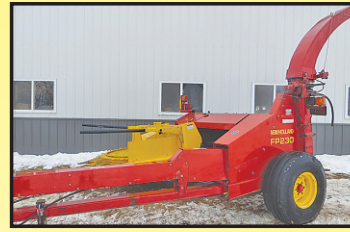
New Holland FP230 w/ CS V-Cut KP rolls and 27P hayhead. Fresh rental return. $16,900