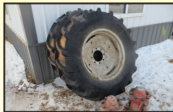
CEAT - 340/85 R24 tires on 8-bolt rims. Tires @ 90%. Comes w/ 8-bolt hubs to fit NH F8230 - FP230. Year-End $1,150