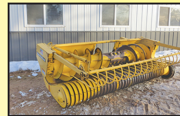
NH 29P 9ft. hayhead. Finger-feed auger. Needs 1 tooth bar. Mechanics Special. $3,950