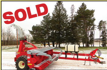
SOLD 2014 Dion F41 w/ hay head, New CS V-Cut processor rolls, Original Knives. Nice Unit. $43,500