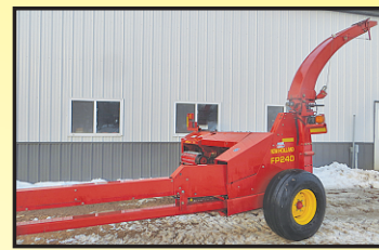
New Holland FP240 w/ Lebanon processor. Metalert III. Field Ready! $17,900