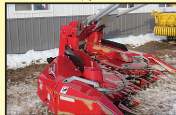
Dion F61 4-row rotary head. Dion chopper mounts. Need a couple bearings. Mechanics Special! $12,500