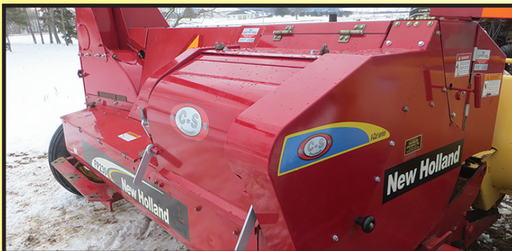
CS V-Cut processors. Free installation until 12-31-19. FP230 $6,000. FP240 $6,500

CALL FOR FREE PARTS CATALOGUE We Ship UPS & Spee Dee