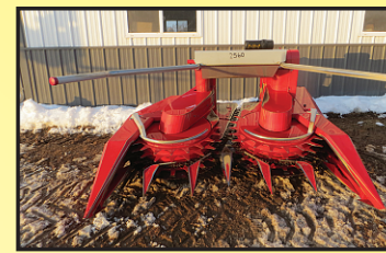
Dion F64 3-row rotary head. Dion chopper mounts. Low Acres + Sharp Appearance! Can adapt to NH FP230 - FP240. $16,500