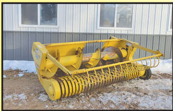
NH-27P hayhead. Nice & Straight. Pickup was just rebuilt. $1,250