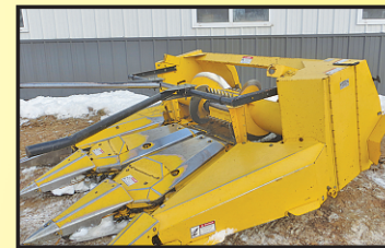
NH 3PN 3-row heads. 4 available. Starting @ $6,500