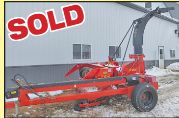
SOLD Fox 4110 w/ hayhead. Black Spout-late model. $1,650