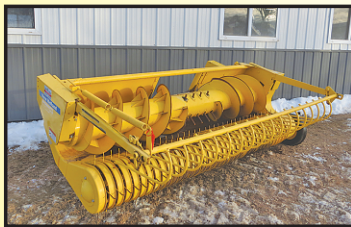
2012 NH 29P hayhead. Very Low Acres. Nice appearance. Compare to New @ $6,500