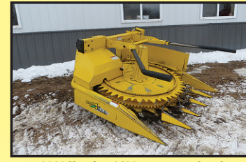
2019 Horning 1402 rotary cornhead. Low Acres. $9,995