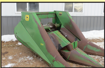
JD 243 2-row snaplage head. 30"-row. New chains & sprockets. Year-end $1,500