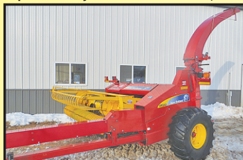
2010 New Holland FP240 w/ 29P 9ft hayhead. CS V-Cut processor. Field ready! $29,500