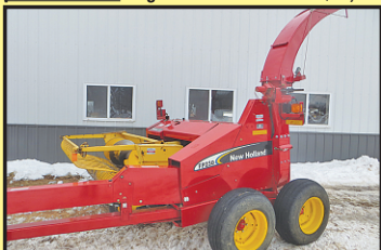
NH FP230 w/ hayhead and New CS V-Cut processor. Totally rebuilt. New stainless steel spout. Tandem axle. Sharp Appearance! $24,900