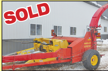
SOLD 2000 NH FP230 w/ 29P hayhead and CS V-Cut processor. 1 year on total rebuild. $23,500