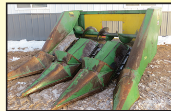
JD 343 snaplage head w/ FP230 - FP240 adapter. Decent rolls. Fresh Rental Return. $5,900