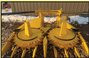
2018 Horning 1403 3-row rotary head. Less than 500 acres! $19,500