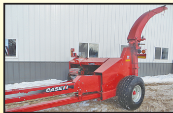
2012 Case IH FHX300 chopper. CS V-Cut processor. Nice Appearance. Solid Unit. $21,900