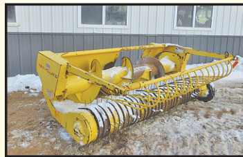
NH 27P hayhead. Set up for FP230. A little Rough, but everything works. $850