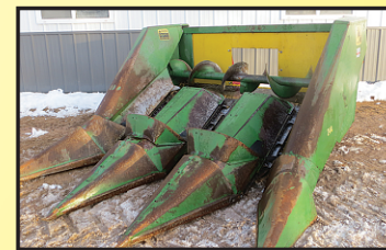
JD 343 Snapper head Calmer Knife rolls. Poty snouts. Electric adjust deck plates. $10,900