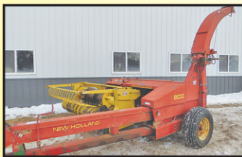
NH 900 w/ 990W hayhead. New Shearbar. Consigned. $2,950