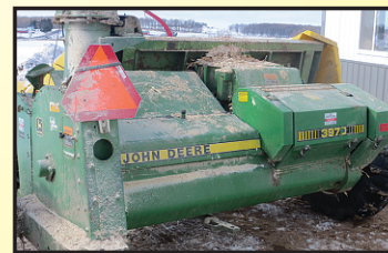
John Deere 3970 w/ 7ft. hayhead. 1-season on horning processor rolls. Ironguard. Long tongue. Green spout. Field ready! $9,950