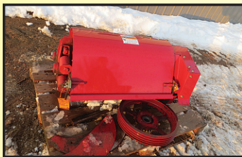
New Holland FP240 factory kernel processor kit. Only 3 yrs. old. $2,950