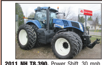
2011 NH T8.390 , Power Shift, 30 mph, cab and front axle suspension, Rear Duals, Front 3pt and PTO ready, 540-1000 PTO, 5 Hyd remotes, C18749..... $104,995 3.90% FOR 48 MONTHS TO QUALIFIED BUYERS