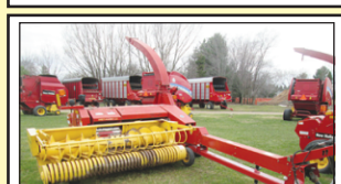
NEW HOLLAND FP230 , metal alert, processor, 27P hay head..... $19,500