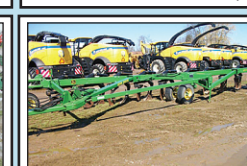
JD 3700 , 10x18 bottom, on land hitch, auto reset, cover boards, coulters, split tandem transport, C18544..... $12,450