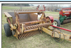
LEON Fy WIDE , 540 PTO, Drive Rock Picker..... $2,995