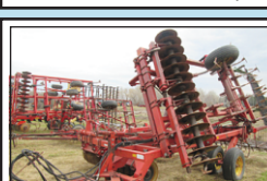
SUNFLOWER 6220 , 18ft soil finisher, Hyd depth control on front disk, 6 bar spike tooth, rear finisher..... $13,995