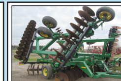
JD 630 , 30ft disk, 24 inch blades, extra clean, C18316..... $14,850