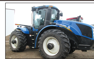
NEW HOLLAND T9.450 , 2013, with only 823 hours, Good tires, 4 remotes, diff lock..... $166,500