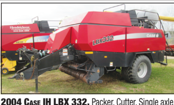
2004 Case IH LBX 332 , Packer, Cutter, Single axle, applicator, Last bale eject, C16981..... $27,500 WITH 0% FOR 36 MONTHS TO QUALIFIED BUYERS