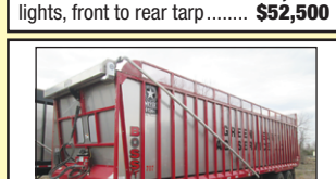
MEYER 9136RT , 36 ft Semi chopper box, 14" screen ext, gate delay, front to back tarp..... $55,900