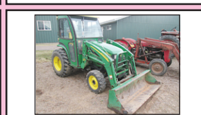
JOHN DEERE 4310 COMPACT TRACTOR , 4 wheel drive, 3 spd hydro, cab with heater, 2 doors, with 300X quick attach loader and JD 72" belly mower..... $16,750