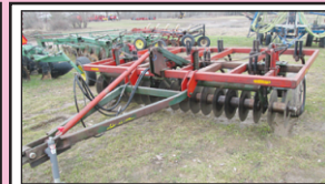
BRILLION CD91 , 9 shank chisel plow, 4" twist shovels, 20" front blades..... $4,795