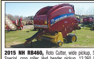
2015 NH RB460 , Roto Cutter, wide pickup, Silage Special, crop roller, Hyd header pickup, 13,260 bales, C17935..... $22,500 0% FOR 36 MONTHS TO QUALIFIED BUYERS