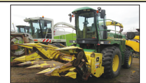
JOHN DEERE 6750 SELF/PROPELLED CHOPPER , 4 wheel drive, 6 row corn head, processor, hay head... $57,995