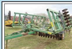
JD 724 , 21ft. Field finisher, 9in sweeps, front disk, 5 bar spike tooth harrow..... $5,950