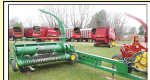
JOHN DEERE 3970 , with hay head..... $6,795