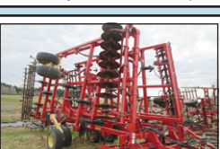
KRAUSE TL 24FT FIELD FINISHER , 24ft Hyd Control on front disk, knock off sweeps, 5 bar rear finisher, rear hitch..... $21,850