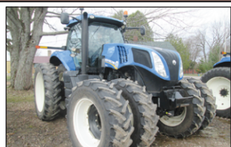
2013 NH T8.330 , Power Shift, 30 mph, Front and rear duals, 5 Hyd remote, 540-1000 PTO, cab and front axle suspension, C18740..... $90,999 3.90% FOR 48 MONTHS TO QUALIFIED BUYERS