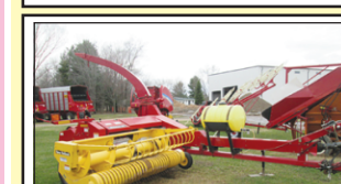
NEW HOLLAND FP230 , metal alert, processor, with 29P hay head... $18,500