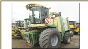
KRONE BXV12 S/P CHOPPER , FWD, processor, hay head and corn head..... $119,900