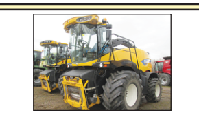
NEW HOLLAND FR600 S/P CHOPPER , FWD, guidance ready, yield and moisture kit, camera, hay and corn heads..... LOW RATE FINANCING