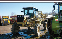
ROGATOR 664 S/P SPRAYER , 2 spd. hydro, 60' booms, 660 gallon, 4x4, hyd. adjust. axles, Cummins 5.9L engine..... $17,500