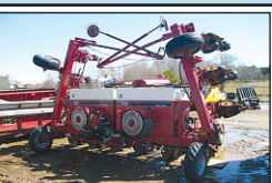
CASE IH 900 , 3pt mount, 12 row planter, 30 inch row, twin seed box, Bean and Corn drums, 1000 PTO pump, IT'S CLEAN!..... $5,950