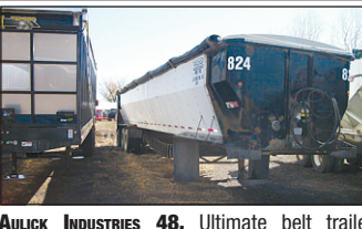
AULICK INDUSTRIES 48 , Ultimate belt trailer, Tandem axle with rear tag axle, roll tarp..... $22,500