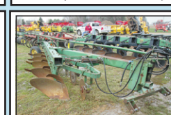
JD 2600 , 4x18 Plow, auto reset, 3pt mount, C18223..... $895