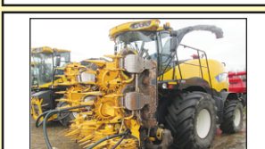
NEW HOLLAND FR650 S/P CHOPPER , FWD, Scherer processor, hay and corn heads, HID lights..... Let's Make A Deal!!