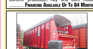
MEYER 4620 CHOPPER BOX , 20ft front unload, on Meyer 1906 tandem wagon... $13,250