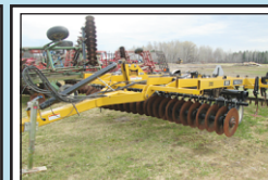
LANDOLL 850 , 14ft Field Finisher, Front rock flex gangs, 5 bar finisher..... $8,250