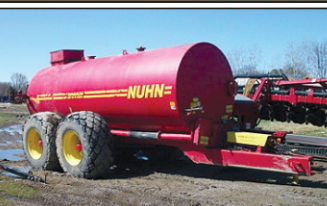
NUHN 6000 MANURE TANK , tandem axle, Excellent Shape..... $28,950