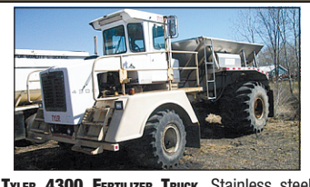
TYLER 4300 FERTILIZER TRUCK , Stainless steel box, 3208 diesel eng, Allison 5 speed auto trans, C18018..... $5,995