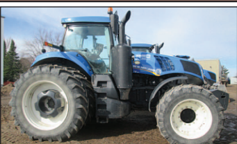
NEW HOLLAND T8.410 , 2015, 19 Spd. Powershift, 50 KPH, Nav II receiver. ONLY 1,052 HOURS ..... $196,500