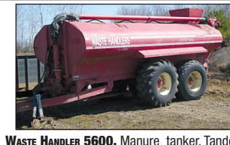
WASTE HANDLER 5600 , Manure tanker, Tandem axle, 23.1x16 tires, Top discharge, C18476..... $6,995 NEEDS WORK