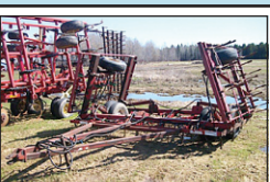
22FT SPRING TOOTH DRAG , walking tandems, Hyd Lift and fold..... $2,995