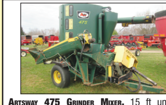
ARTSWAY 475 GRINDER MIXER , 15 ft unload Auger, scale, 3 Screens, 105 B.U., 540 PTO..... $7,945