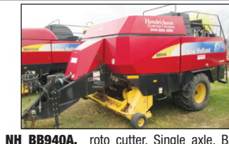
NH BB940A , roto cutter, Single axle, Bale eject, applicator, C16374..... $25,995 0% FOR 3 YEARS TO QUALIFIED BUYERS