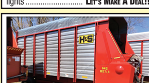
H&S 7+4 HD , 20ft, front & rear unload, chopper box on H&S 617 tandem gear, with truck tires..... $12,995