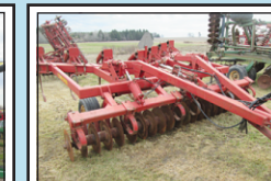
SUNFLOWER 4010 , 7 Shank ripper, Rock plex, Front gang, Hyd depth control..... $5,995