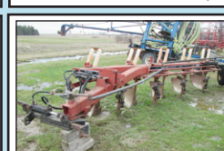
IH 735 , Variable width, 5 bottom, Auto reset, C17266..... $995