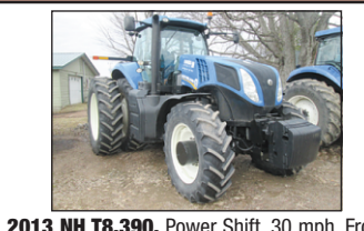
2013 NH T8.390 , Power Shift, 30 mph, Front and rear duals, cab and front axle suspension, has front 3pt, and front PTO ready, 540-1000 PTO, 5 Hyd remotes, C18748..... $107,595 3.90% FOR 48 MONTHS TO QUALIFIED BUYERS