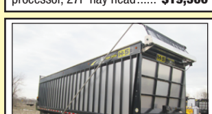
H&S TOP DOG 36 FT SEMI BOX , LED lights, front to rear tarp..... $52,500