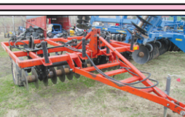
CASE 7 SHANK CHISEL PLOW , New 4" shovels, spring loaded front discs..... $4,750