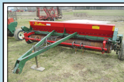
BRILLION 12FT SEEDER , Single box hyd. lift..... $8,000