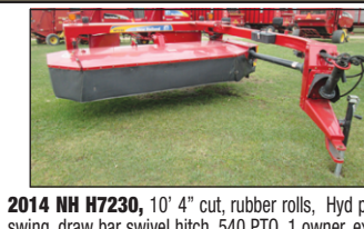
2014 NH H7230 , 10' 4" cut, rubber rolls, Hyd pole swing, draw bar swivel hitch, 540 PTO, 1 owner, extra nice, C18712..... $17,995 0% FOR 36 MONTHS TO QUALIFIED BUYERS