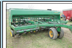
JD 750 , No till drill, 15ft wide, front dolly wheels, 7 inch spacing, 24 units, C18828..... $10,995