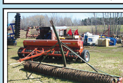
BRILLION 15FT PULL TYPE PACKER , C18627..... $1,575