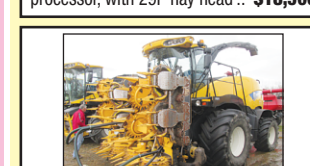
NEW HOLLAND FR700 S/P CHOPPER , 1,150 cutterhead hours, yield and moisture sensors, Scherer processor, hay and corn heads..... FINANCING AVAILABLE UP TO 84 MONTHS