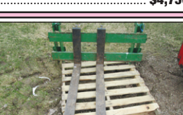
JOHN DEERE PALLET FORK , for JD 300X loader..... $450