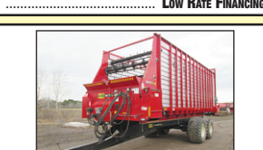
H&S 7+4SD , 24ft, front and rear unload, chopper box on H&S 24/26 oscillating trailer, total in cab controls..... $36,500