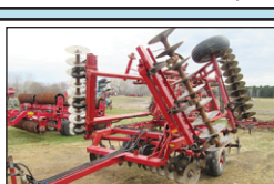
CASE IH 3950 , 29ft rock flex disk, 7 1/2 inch spacing, 3 bar rear finisher..... $14,250