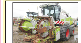
CLASS 900 SELF/PROPELLED CHOPPER , 4WD, processor, corn and hay heads..... $117,500