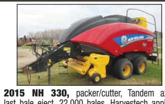
2015 NH 330 , packer/cutter, Tandem axle, last bale eject, 22,000 bales, Harvestech applic., C17769..... $62,500 0% FOR 36 MONTHS TO QUALIFIED BUYERS