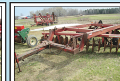
IH 770 , 14ft offset disk, good blades..... $3,650