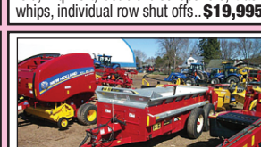
'14 H&S 370HD BOX SPREADER , poly floor and sides, hyd. endgate, EXTRA NICE & CLEAN..... $14,850