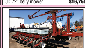
WHITE 6180 16 ROW CORN PLANTER , center fold, Lig. fert, double disc openers, grass whips, individual row shut offs..... $19,995