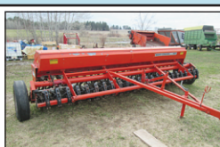
MF 424 14FT GRAIN DRILL , Double disc, rear grass with press wheels..... $4,995