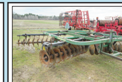
JD 215 , 15ft disk, 20in blades with scrapers..... $3,750