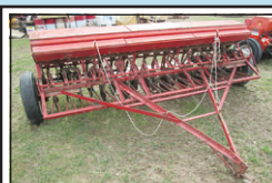
McCORMICK GRAIN DRILL , 10ft, grass seed, rope pull lift..... $1,675