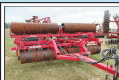
BRILLION 25FT CULTIMULCHER , 20 rollers, scrapers front and back, w/center teeth..... $27,995