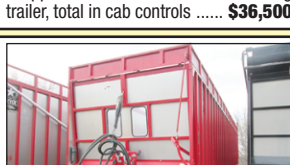
MEYER 9140RT , 40ft Semi box, 14" screen ext, gate delay..... $49,995