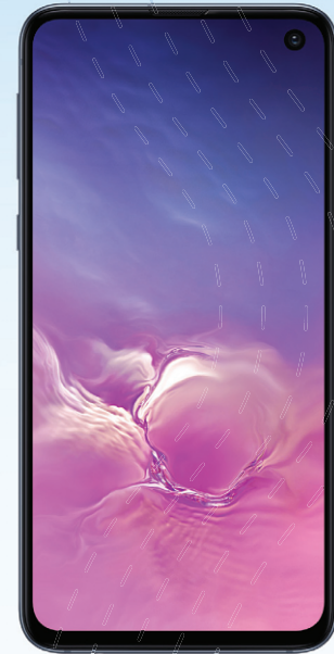
SAMSUNG Galaxy S10e

Get $10 OFF a bundle of essential accessories, no additional purchase necessary, only at Cell.Plus.