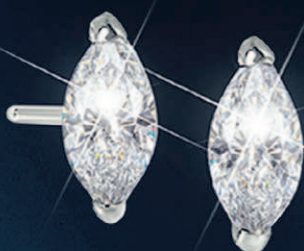
Marvelous Marquise 1.2-carat Marquise Cut