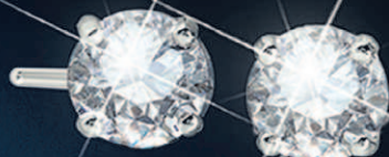
Premier Pear 2.4-carat Pear Cut