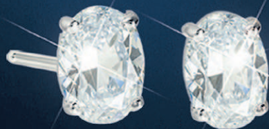
Radiant Round 1.1-carat Oval Cut