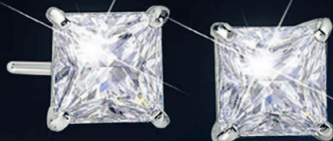
Poised Princess 3.8-carat Princess Cut