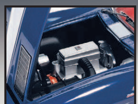
The hood seamlessly lifts to reveal details of this world-class race car's fuel-injected 360 horsepower engine.

1:18-Scale Die Cast Measures 10 1/2" Long; Tooled with OVER 200 Parts