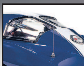
The '63 Corvette was the only model with the split window design, which is accurately captured in 1:18 scale.

Doors open, plus the hood opens to reveal details of this car's fuel-injected 360 HP 327 V-8.