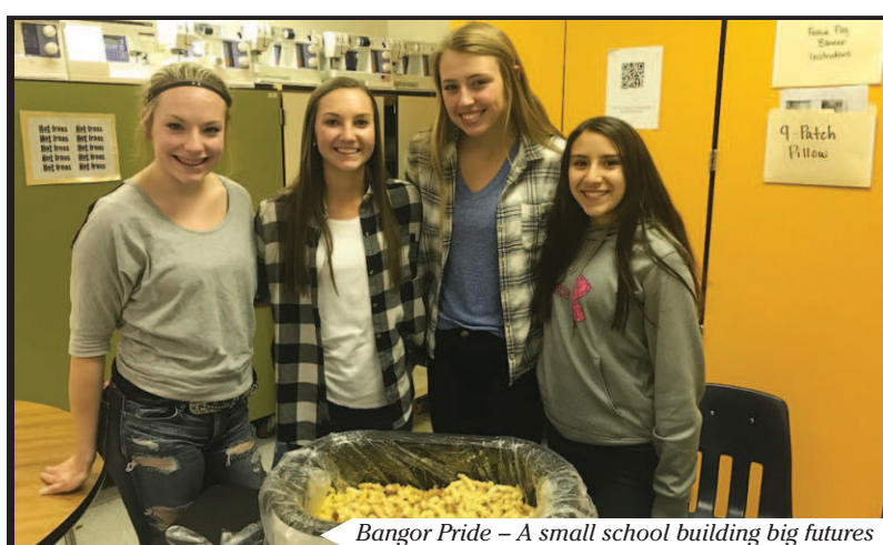
Bangor Pride – A small school building big futures