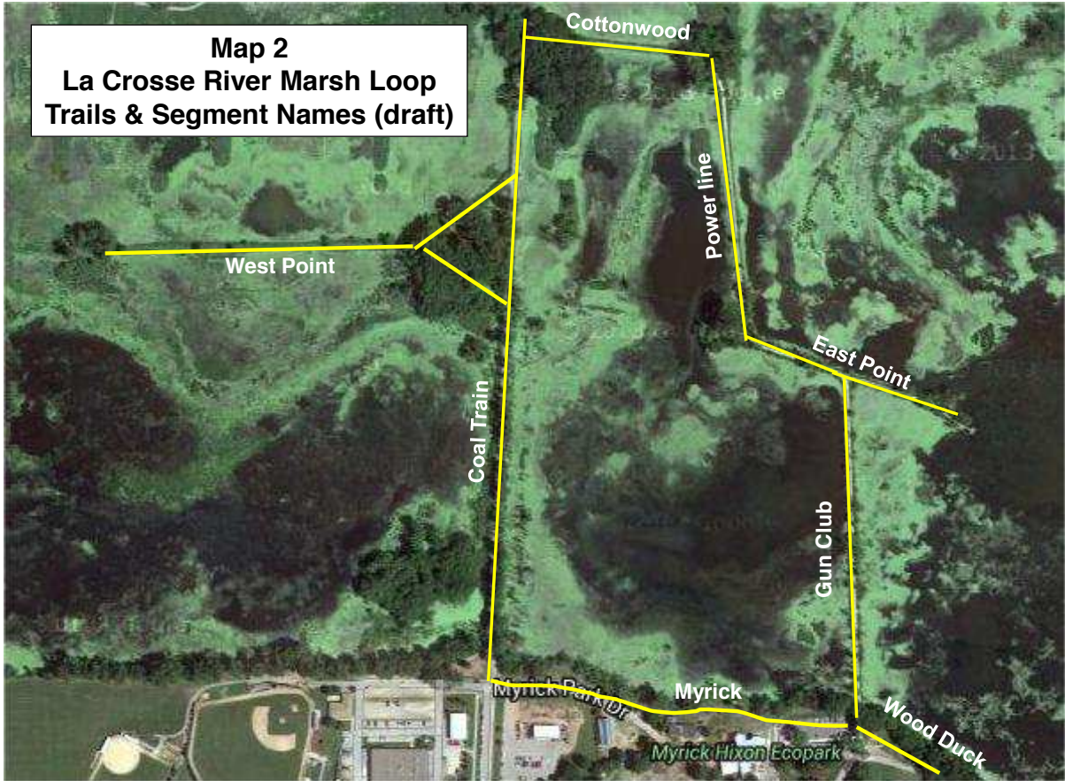
Map 2 La Crosse River Marsh Loop Trails & Segment Names (draft)