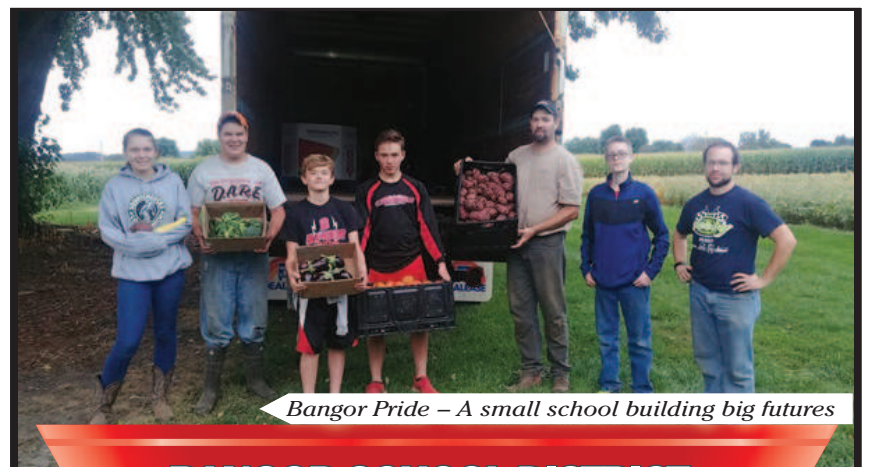
Bangor Pride - A small school building big futures