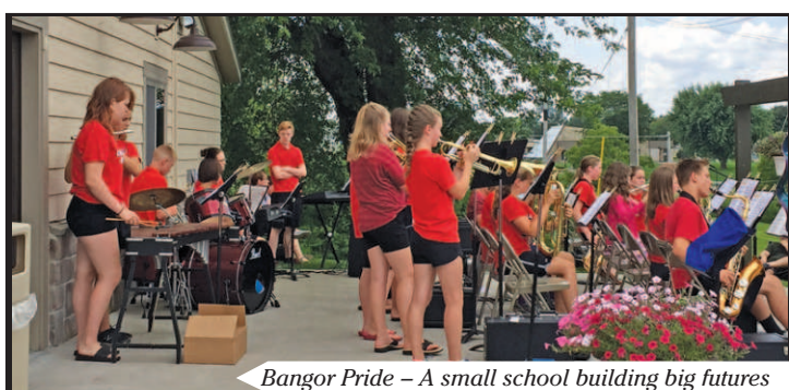
Bangor Pride – A small school building big futures

They are celebrating their 65 years of marriage With family and friends. They are blessed with 5 children.