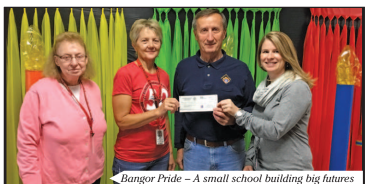
Bangor Pride - A small school building big futures

They would love to hear from old friends! 123 4th Ave. NE, Spring Grove, MN 55974