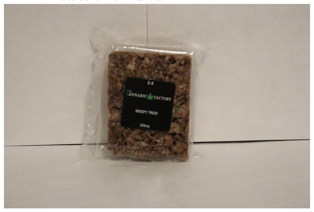
94. Cannabis Factory manufactures, produces, imports, distributes, promotes, displays for sale, offers for sale, attempts to sell, and sells THC-containing products, the labels and packaging of which