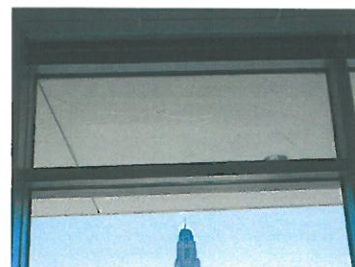
4 total rounds through the top floor of 1010 Lincoln Mall after the Saturday night riots