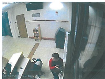
6 suspected rounds were confirmed striking the Hall of Justice. One round came through the window as an investigator was standing nearby.