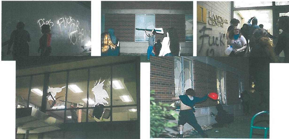
Damage to Lincoln businesses along Lincoln Mall: Millions