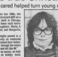
Woman shares true Christmas story

A gift that showed someone cared helped turn young mother's life around