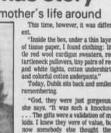
Woman shares true Christmas story

A gift that showed someone cared helped turn young mother's life around