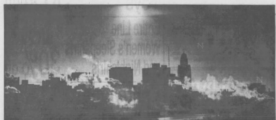
It's not as hot as it looks, even with the sun out. The clouds of steam are from furnaces fighting subzero temperatures.