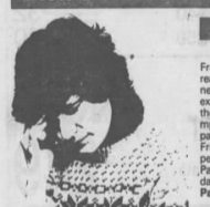
Singing blues may be just thing this holiday

Lincoln: Mostly sunny and cold on Friday. High only reaching 5 below to near zero. Winds are expected to be from the north at 10 to 15 mph. Skies becoming partly cloudy by Friday night. Continued very cold temperatures with a low of 15 to 20 below. Partly cloudy and cold again on Saturday. High near zero. (Weather Dept., Page 17)