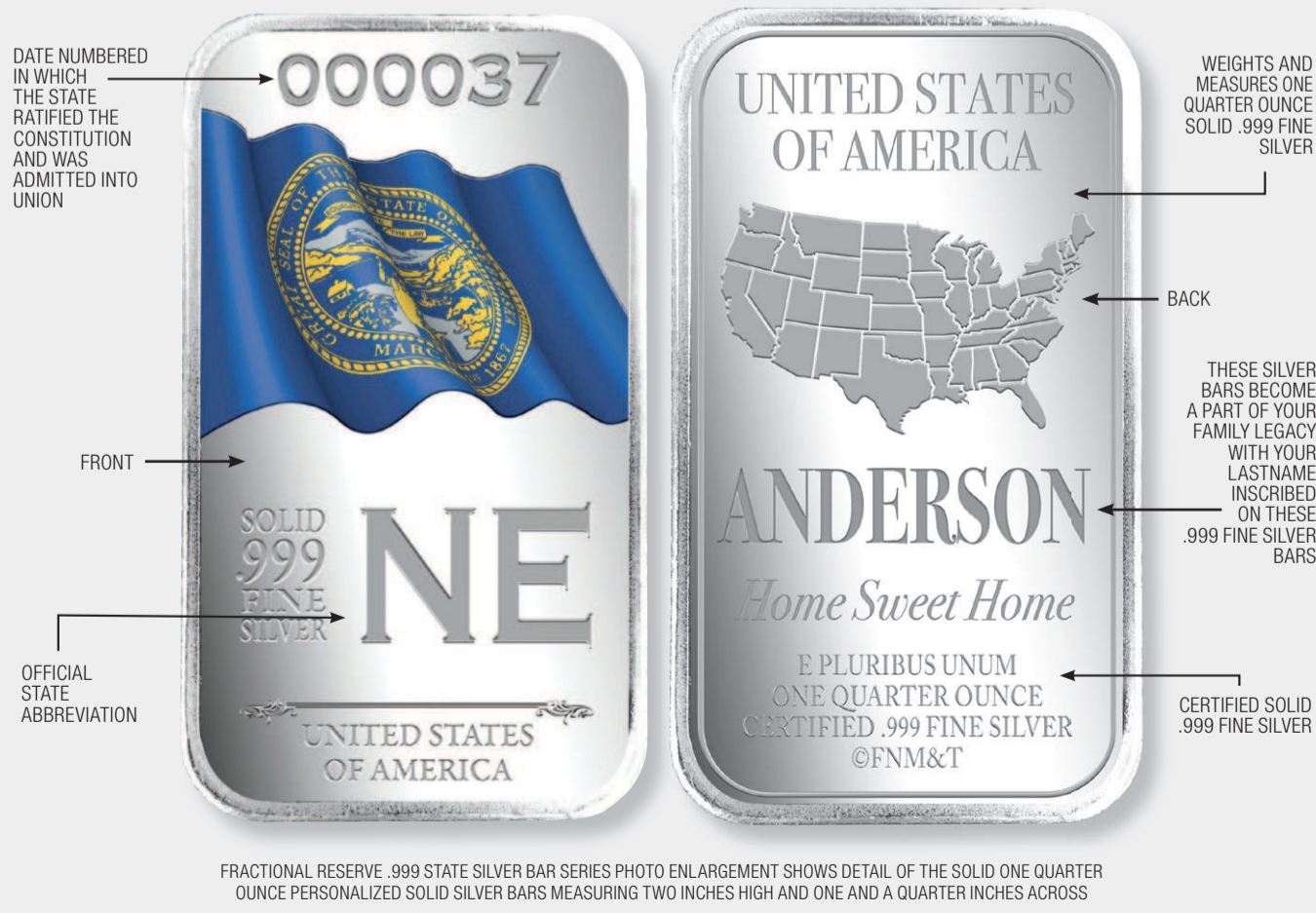
FRACTIONAL RESERVE .999 STATE SILVER BAR SERIES PHOTO ENLARGEMENT SHOWS DETAIL OF THE SOLID ONE QUARTER OUNCE PERSONALIZED SOLID SILVER BARS MEASURING TWO INCHES HIGH AND ONE AND A QUARTER INCHES ACROSS

► Can I buy one State Silver Bar: Yes. But, the reduced State Minimum set by the Lincoln Treasury of just $39 per bar applies only to residents who purchase a Silver Vault Bag(s). That means only those residents who order a Silver Vault Bag(s) or a Jumbo Silver Ballistic Bag get the reduced State Minimum set by the Lincoln Treasury. All single bar purchases, orders placed after the deadline and all non-state residents must pay the normal state minimum of $59 per silver bar.