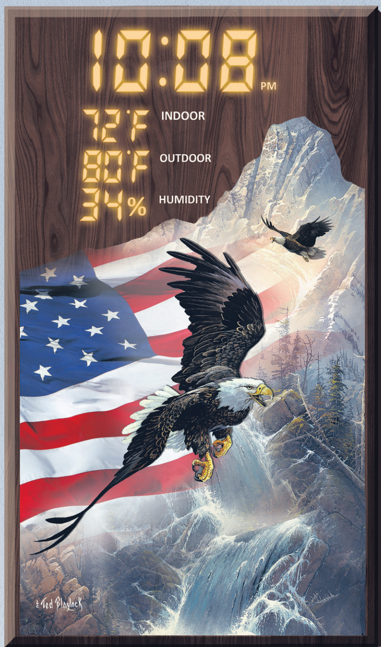
Actual size is 12 in. H x 6½ in W. Power cord included.