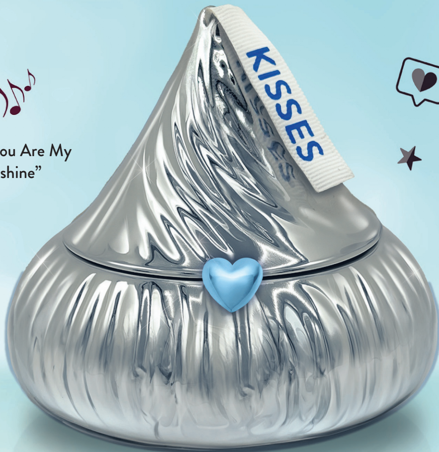
Actual size is about 3¼" H