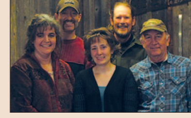
Dubois Frontier EMPLOYS 5 PEOPLE 8 C Street 455-2525