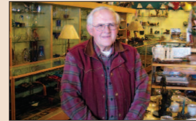
Welty's General Store EMPLOYS 3 PEOPLE 113 W. Ramshorn 455-2377