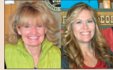
Water Wheel Gifts & Books EMPLOYS 3 PEOPLE 113 E. Ramshorn 455-2112