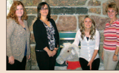
Wells Fargo EMPLOYS 5 PEOPLE 502 W. Ramshorn 455-2821