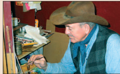
Silver Sage Gallery EMPLOYS 2 PEOPLE 124 E. Ramshorn 455-3002