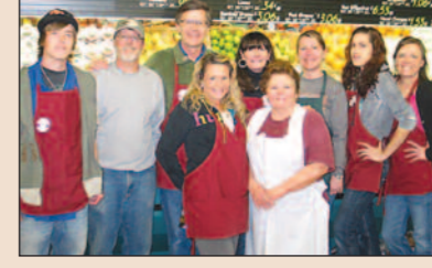
Dubois Super Foods EMPLOYS 23 PEOPLE 610 W. Ramshorn 455-2402