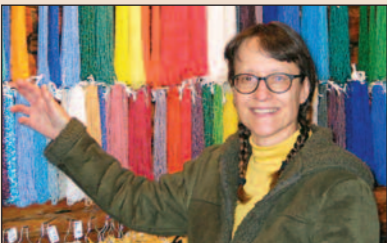
Tukadeka Traders/Horse Creek Gallery EMPLOYS 2 PEOPLE 104 E. Ramshorn • 450-3345