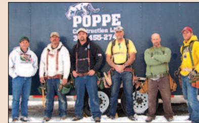
Poppe Construction EMPLOYS 6 PEOPLE 455-2746