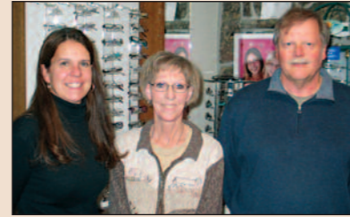
Dubois Vision Center EMPLOYS 4 PEOPLE 1203 W. Ramshorn 455-2125