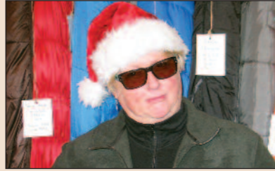
Wind River Gear EMPLOYS 5 PEOPLE 19 N. First Street 455-3468