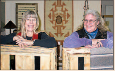
Pony Tracks Gallery EMPLOYS 2 PEOPLE 128 E. Ramshorn Street 455-4007