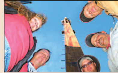
Ram Wireless EMPLOYS 1 PERSON 132 E. Ramshorn 455-3434