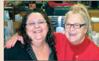
Dubois Drug Store EMPLOYS 2 PEOPLE 126 E. Ramshorn 450-3604

Nationally: If just half the employed U.S. population spent $50 each month in independently owned businesses, their purchases would generate more than $42.6 billion in revenue. (*U.S. Bureau of Labor Statistics, 2/6/2009) Locally: If just one-quarter (250 people) of Dubois' in-town population (that does not include all the folks in the areas surrounding town limits) spent $10 at each of these businesses (Total: $330 per person), their investment in the community would generate $82,500. If 500 people did the same, it would generate $165,000.