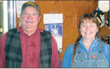
Wind River Meat EMPLOYS 12 PEOPLE 106 W. Ramshorn 455-3366