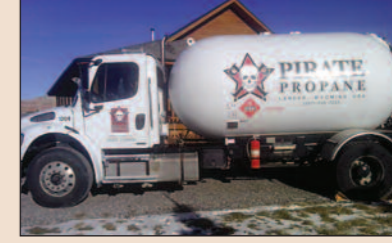
Pirate Propane EMPLOYS 1 Person 450-7333