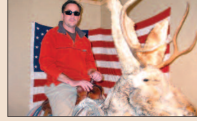
Exxon Country Store EMPLOYS 7 PEOPLE 404 W. Ramshorn 455-2677