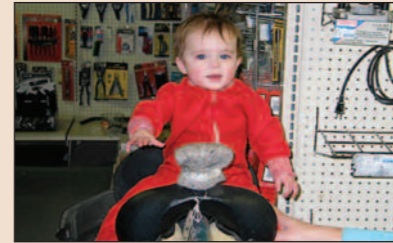
Painted Valley Ranch Supply EMPLOYS 6 PEOPLE 307 S. First Street 455-2991