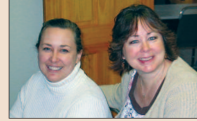
cyber Café EMPLOYS 6 PEOPLE 308 W. Ramshorn 455-4011