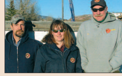
V-1 Propane EMPLOYS 3 PEOPLE 908 W. Ramshorn 455-2315