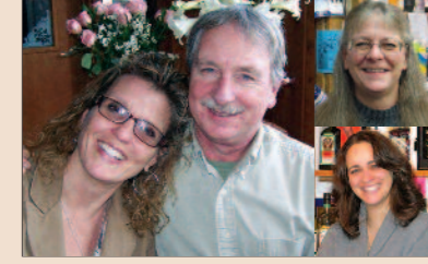
Ramshorn Inn Liquor EMPLOYS 4 PEOPLE 202 E. Ramshorn 455-2444