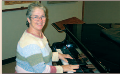
Headwaters Center EMPLOYS 2 PEOPLE 20 Stalnaker Street 455-2687