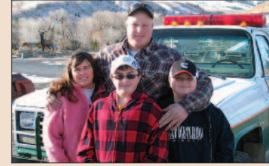
Bull's Conoco EMPLOYS 8 PEOPLE 219 W. Ramshorn 455-2770