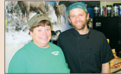
Taylor Creek Exxon EMPLOYS 10 PEOPLE 1426 Warm Springs Drive 455-3320