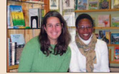
Dubois Museum EMPLOYS 6 PEOPLE 909 W. Ramshorn 455-2284

Thank You!! for Supporting OUR Local Businesses!