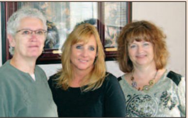
Tegeler & Associates EMPLOYS 3 PEOPLE 712 W. Ramshorn 455-2283