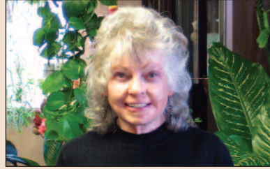
Western Bouquet EMPLOYS 3 PEOPLE 114 Barber 455-4044