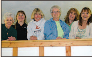
The Opportunity Shop EMPLOYS 5 PEOPLE 1 S. First Street 455-2900