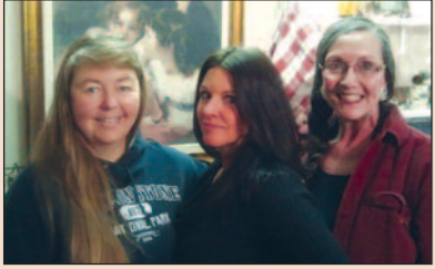
Main Street Mart EMPLOYS 14 PEOPLE 118 E. Ramshorn 455-3101