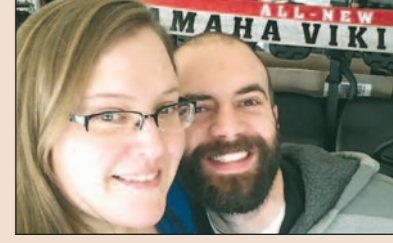
Full Throttle Powersports EMPLOYS 3 PEOPLE 1416 Warm Springs Drive 455-4045