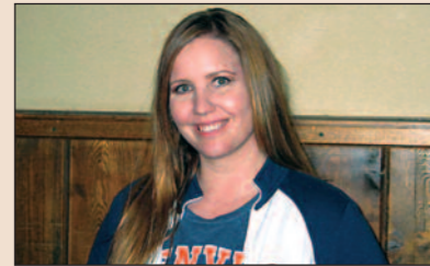
Rustic Pine Grill EMPLOYS 11 PEOPLE 123 E. Ramshorn 455-2772