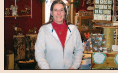
Bighorn Sheep Center Gift Shop EMPLOYS 2 PEOPLE 907 W. Ramshorn • 455-3429