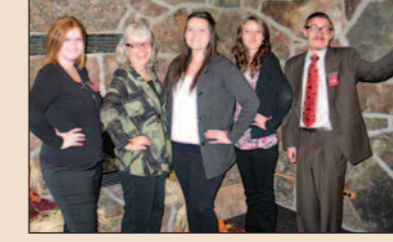
Wells Fargo EMPLOYS 5 PEOPLE 502 W. Ramshorn 455-2821