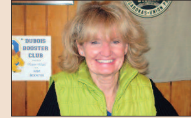
Water Wheel Gifts & Books EMPLOYS 3 PEOPLE 113 E. Ramshorn 455-2112