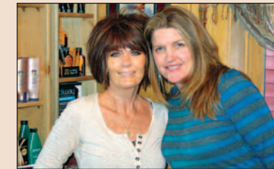
Painted Ladies Hair Salon EMPLOYS 2 PEOPLE 128 W. Ramshorn 455-2803