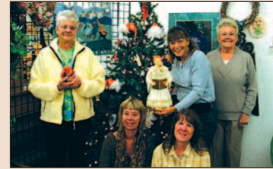
The Opportunity Shop EMPLOYS 4 PEOPLE 1 S. First Street 455-2900