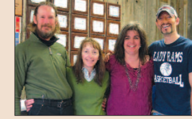
Dubois Frontier EMPLOYS 5 PEOPLE 8 C Street 455-2525