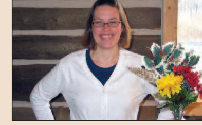
The Backyard Floral Design EMPLOYS 1 PERSON 101 Third Street 455-2142