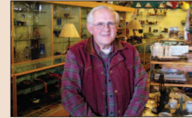
Welty's General Store EMPLOYS 3 PEOPLE 113 W. Ramshorn 455-2377