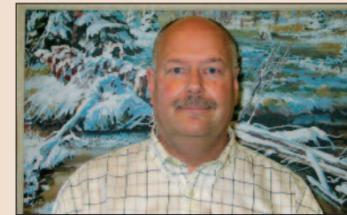
Bank of Jackson Hole EMPLOYS 5 PEOPLE 800 W. Ramshorn 455-3751

Buy Local— Support Yourself. Studies have shown that when you buy from an independent, locally owned business, significantly more of your money is used to make purchases from other local businesses and service providers— continuing to strengthen the economic base of the community. For every $100 spent in independently owned stores, $68 returns to the community through taxes, payroll, and other expenditures. If you spend that in a national chain, only $43 stays here. Spend it online and nothing comes home. (Civic Economics study, 2008)