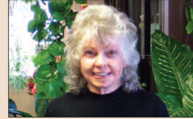
Western Bouquet EMPLOYS 3 PEOPLE 114 Barber 455-4044