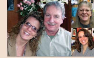
Ramshorn Inn Liquor EMPLOYS 4 PEOPLE 202 E. Ramshorn 455-2444

Nonprofit organizations receive an average 250 percent more support from smaller business owners than they do from large businesses. It is our local businesses who continually donate to our groups, organizations and school for their fundraising activities.