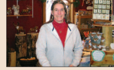
Bighorn Sheep Center Gift Shop EMPLOYS 2 PEOPLE 907 W. Ramshorn 455-3429