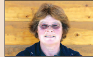
A.D. Martin Lumber EMPLOYS 4 PEOPLE 1 Absaroka Court 455-3850