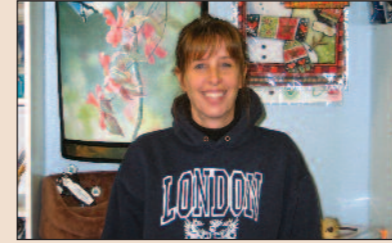
Wiggles EMPLOYS 2 PEOPLE 1422 Warm Springs Drive 450-8247