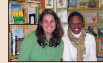
Dubois Museum EMPLOYS 6 PEOPLE 909 W. Ramshorn 455-2284