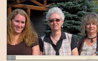
Tegeler & Associates EMPLOYS 3 PEOPLE 712 W. Ramshorn 455-2283