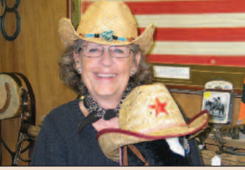
Cowboy Junkies EMPLOYS 1 PERSON 209 E. Ramshorn 455-2986