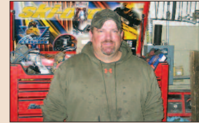
3D Oil EMPLOYS 2 PEOPLE 702 W. Ramshorn 455-2898

Thank You for Supporting Local Businesses!