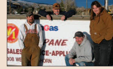
V-1 Propane EMPLOYS 4 PEOPLE 626 S. First Street 455-2315