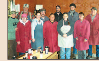
Wind River Meat EMPLOYS 10 PEOPLE 106 W. Ramshorn 455-3366