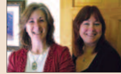
cyber Café EMPLOYS 4 PEOPLE 308 W. Ramshorn 455-4011