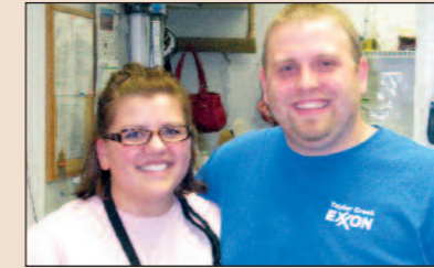
Taylor Creek Exxon EMPLOYS 10 PEOPLE 1426 Warm Springs Drive 455-3320