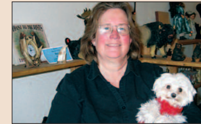
Dubois Old West Store EMPLOYS 2 PEOPLE 132 E. Ramshorn 455-3774