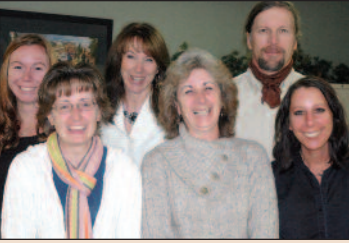
DTE EMPLOYS 19 PEOPLE 12 S. First Street 455-2341