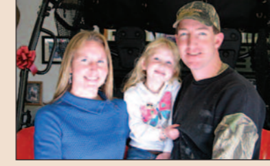
Dubois Honda/ATV EMPLOYS 2 PEOPLE 1510 Warm Springs Drive 455-3825