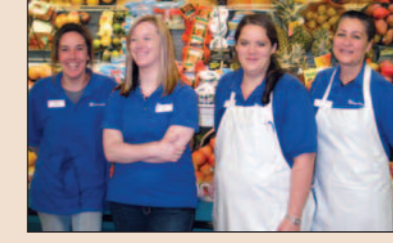
Dubois Super Foods EMPLOYS 20 PEOPLE 610 W. Ramshorn 455-2402