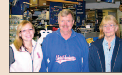
Dubois Hardware/NAPA EMPLOYS 5 PEOPLE 110 E. Ramshorn 455-2838