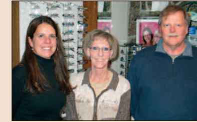
Dubois Vision Center EMPLOYS 4 PEOPLE 1203 W. Ramshorn 455-2125