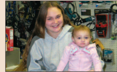
Painted Valley Ranch Supply EMPLOYS 6 PEOPLE 307 S. First Street 455-2991