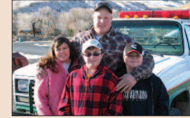
Bull's Conoco EMPLOYS 8 PEOPLE 219 W. Ramshorn 455-2770