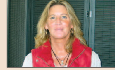
Western Ledgers EMPLOYS 2 PEOPLE 116 E. Ramshorn, 2A 455-3044