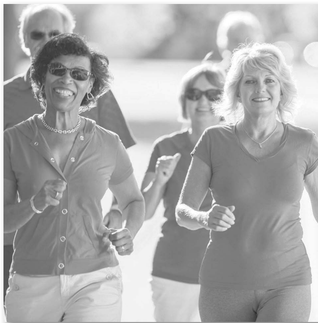
Join the Peace Walk on June 6 at 9 a.m. The group meets in the parking lot at 95 and Birch in Cambridge.

Alano Club, 790 Heritage Blvd. Isanti. 763-444-4605