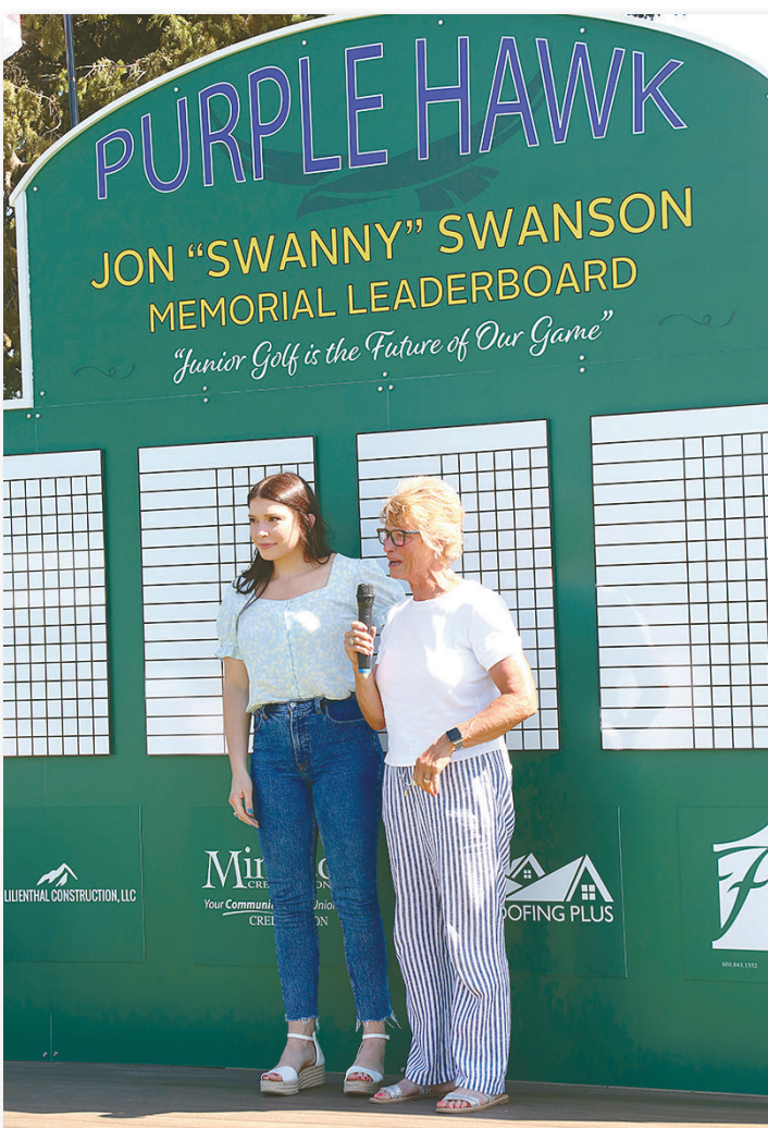
BILL STICKELS III | COUNTY STAR

LEND ME YOUR EAR: Discover Downtown Third Thursday features corn feed . PAGE 3