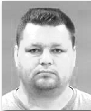
ISANTI COUNTY JAIL ROSTER

According to a search warrant obtained by multiple Twin Cities news stations, her body was found partially buried on a property owned by Peterson. Preliminary examination indicated a "projectile consistent with a bullet" in