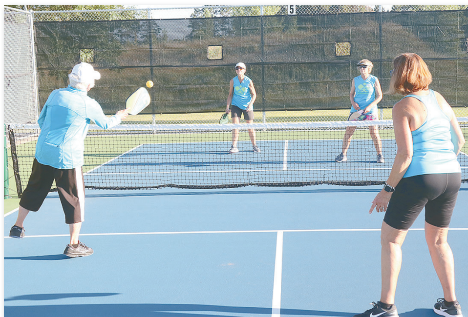
BILL STICKELS III | COUNTY STAR