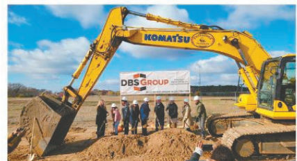
Pictured: Boka Haven Assisted Living, Warm & Woolly Yarn & Minnco Credit Union

For Member News, Chamber Focus, Community Updates and other information check out our website at www.northbranchchamber.com