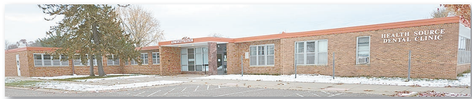
BILL STICKELS III | COUNTY STAR

The Administration Building was the last building to be actively used, which was as a dental clinic. It was completely vacated last spring.