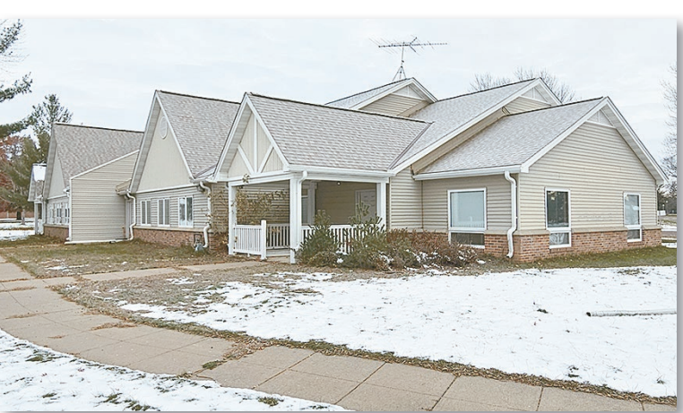
BILL STICKELS III | COUNTY STAR

This youngster figured he would just embrace Christmas season overlapping into Halloween and dressed up as the Grinch for Trunk or Treating at Phoenix Academy in North Branch. See page 2 for more photos of our favorite Halloween costumes.