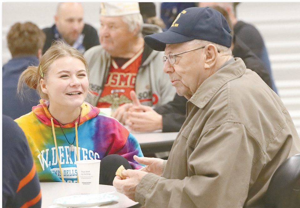
BILL STICKELS III | COUNTY STAR

All area veterans are invited to a free breakfast with Cambridge-Isanti High School students from 7:30 to 8:30 a.m. on Friday, Nov. 10 in the CIHS cafeteria.