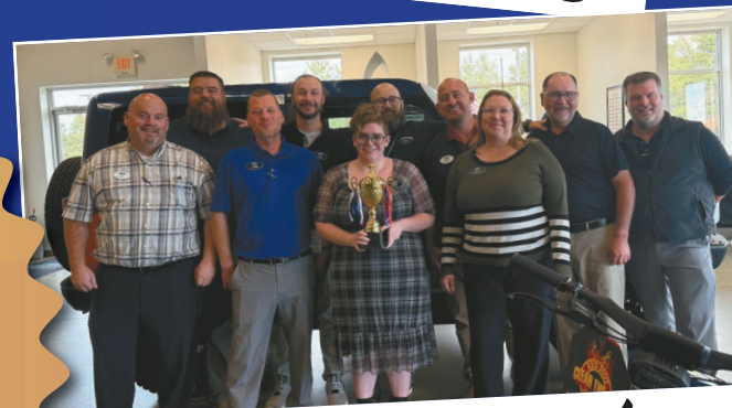
BEST USED & NEW SALES