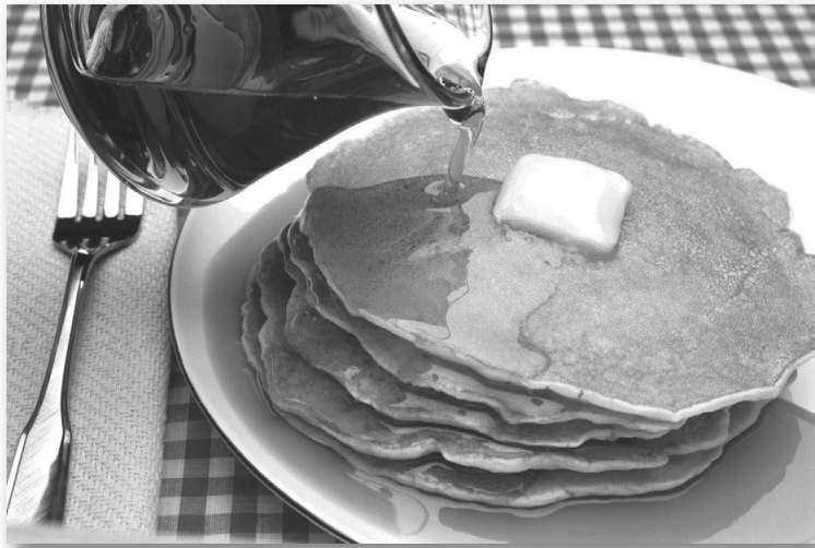
The Isanti Lions Club is hosting a Pancake Breakfast Nov. 16.

Third Monday 11 a.m. to noon at Isanti SAC, 140 Buchanan St., N. #164 Cam-