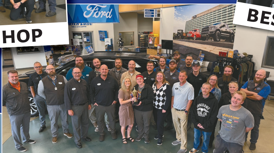
BEST PLACE TO WORK