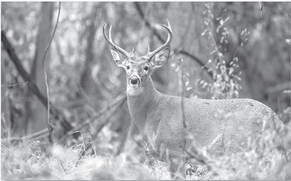
By donating hides, hunters not only reduce waste but also contribute to ongoing conservation, education, and land stewardship efforts that keep Minnesota’s outdoor heritage strong. ~ The Minnesota Deer Hunters Association

also provide valuable support for youth education programs and scholarships, helping to inspire the next generation of conservation-minded hunters. Local programs such as Forkhorn Camps, the National Archery in the Schools Program (NASP), and Dollars for Scholars have all benefited from Hides for Habitat contributions. In addition, the program has played a role in land acquisitions that become public Wildlife Management Areas (WMAs), preserving more outdoor spaces for everyone to enjoy. Hunters can easily take part by donating their deer hides after the hunt. Collection boxes—painted bright orange and clearly marked with the MDHA logo—are set up throughout the community for convenient drop-off. To find an official hide drop station near you, visit the Isanti County MDHA Facebook page, check the MDHA website at mndeerhunters.com , or call 800-450-3337 for more information.