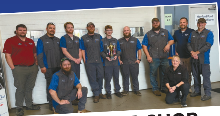
BEST REPAIR SHOP

THANK YOU TO ALL OF OUR CUSTOMERS FOR VOTING FOR US! AT HAYFORD FORD, WE PROVIDE THE BEST POSSIBLE EXPERIENCE FOR OUR CUSTOMERS.