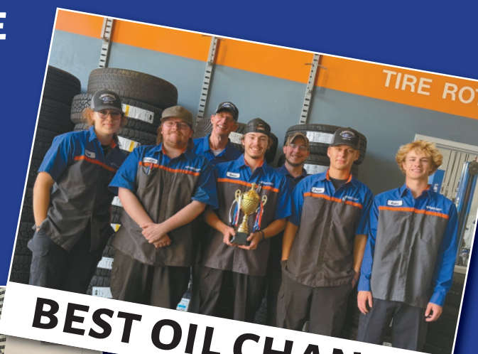
BEST OIL CHANGE