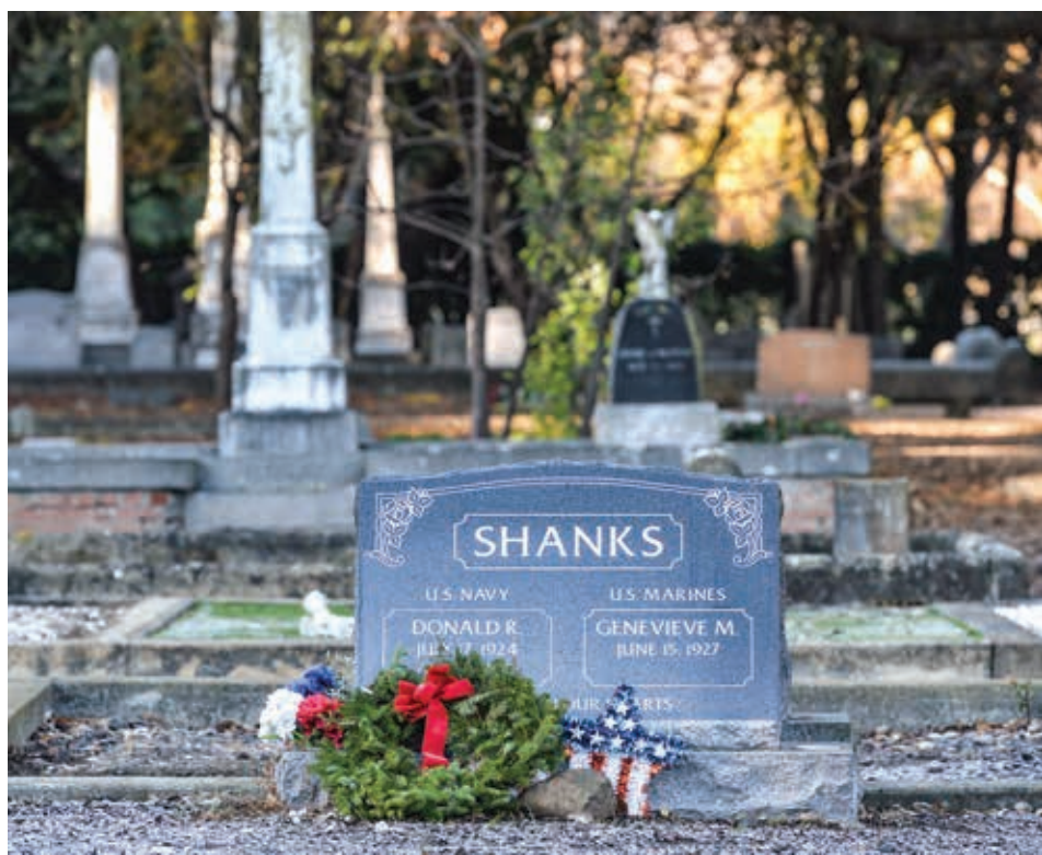
As part of the National Wreaths Across America, in honor of veterans, the Jose Maria Amador Chapter – DAR sponsored Dublin's Pioneer Cemetery wreath placement, Saturday, Dec. 19.