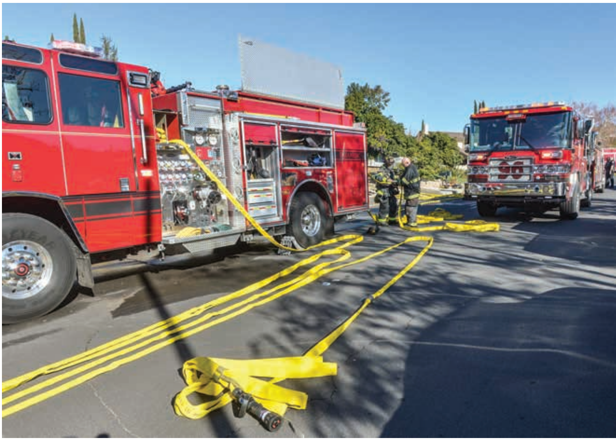
Livermore-Pleasanton Fire Department firefighters responded to a residential fire on Farnsworth Drive in Livermore, Sunday, Dec. 20.