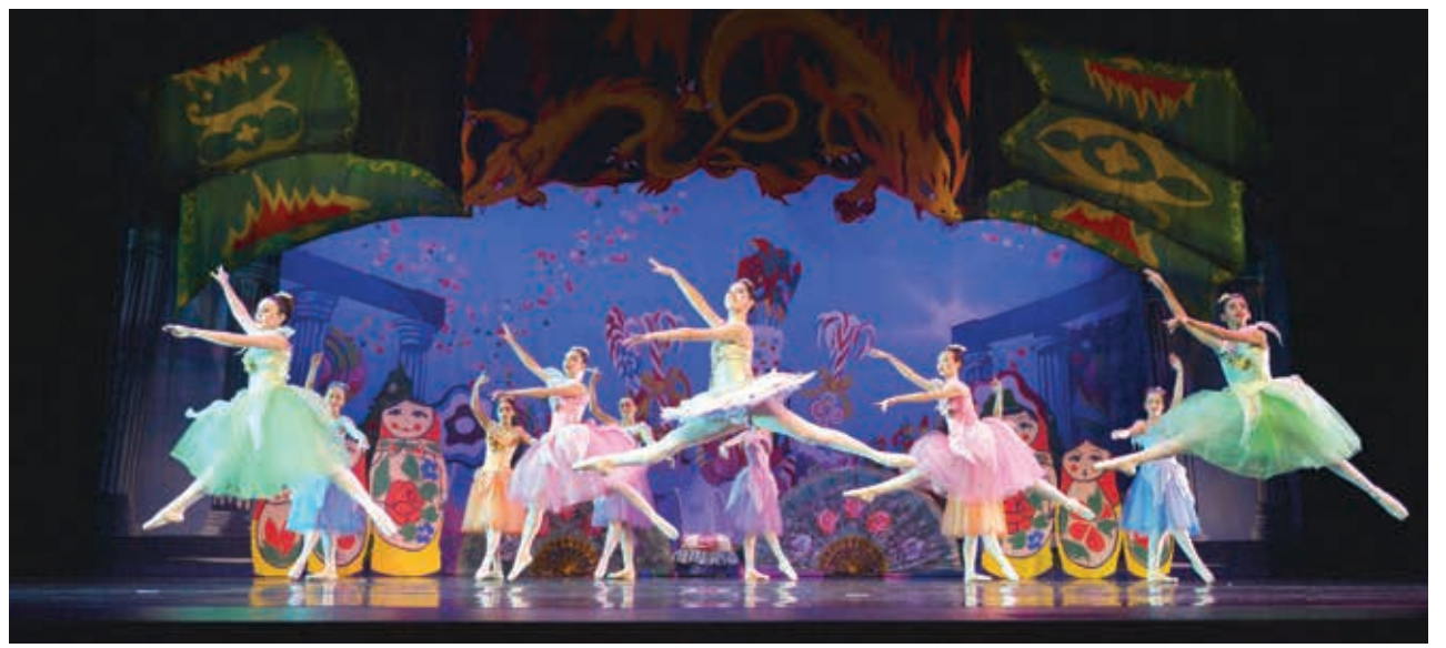
A pandemic relief bill passed by Congress this week could help theater venues across the nation. It awaits approval from the president. Seen here is a December 2019 performance of "The Nutcracker" at Livermore's Bankhead Theater.

Besides the Livermore venues, others included in the coalition are The Greek Theater in Berkeley, The Ivy Room in Albany and the Oakland Metro Operahouse.