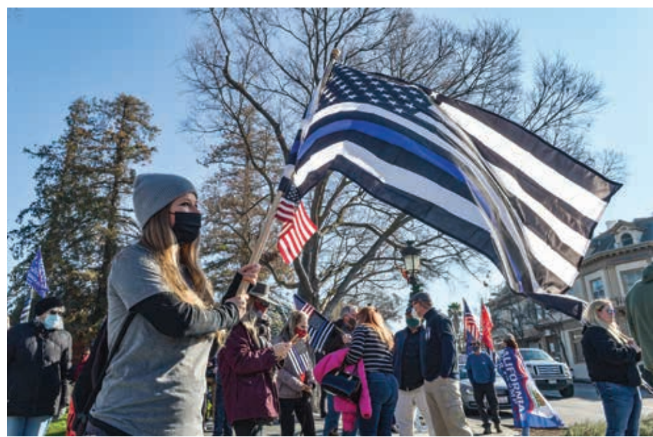
A rally in support of law enforcement and the Blue Line flag gathered at the intersection of South Livermore and First Street, on Saturday, Dec. 19.

"Unfortunately, symbols can have very different meanings to different