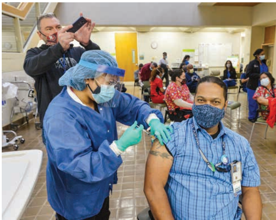
Friday, Dec. 18, Livermore Veterans Hospital began inoculating the staff and patients with the first round of COVID-19 vaccines.