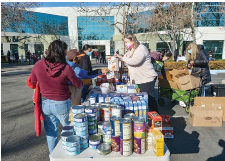
Hively, a nonprofit in Pleasanton that serves families in need throughout the Tri-Valley and Livermore, hosted a toy drive on Saturday, Dec. 19.