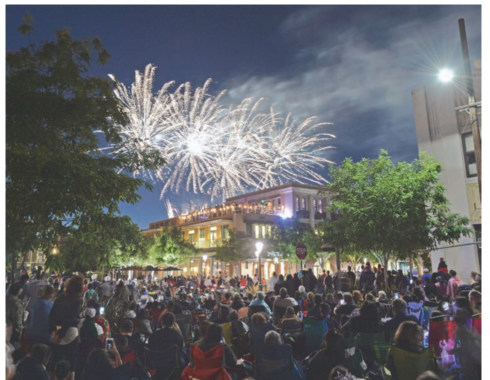
Livermore's Fourth of July celebrations will take place at Robertson Park on Tuesday, July 4. The fireworks show is moving from downtown, above, to the park this year to accommodate larger crowds and ensure safety measures.

sion applies when the guest using the fireworks cannot be identified.