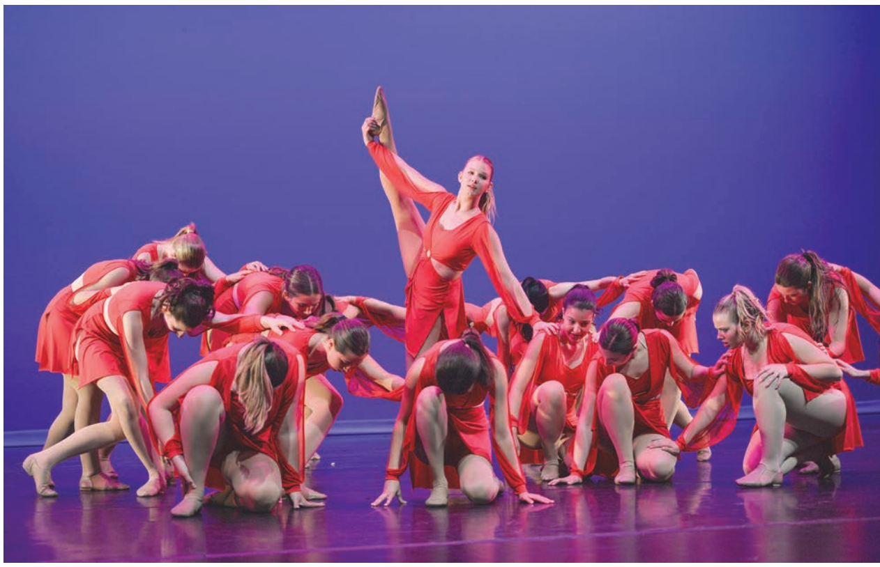
The Livermore School of Dance performed “Throwback Thrills” featuring their Jazz Division, above, along with the ballet company’s version of “Rapunzel,” on June 14 and 15 at Dublin High School’s Performing Arts Theater. [See photo gallery at www.independentnews.com/multimedia ]