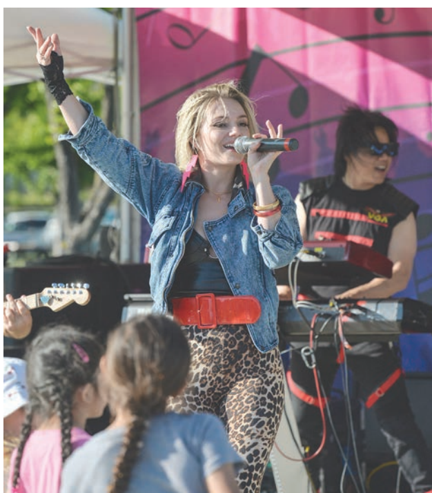
Dublin's Summer Concert Series opened on Thursday, June 15 with a performance by Careless Whisper. The series runs for eight weeks at the Emerald Glen Park Amphitheater on Thursday evenings during the Dublin Farmers Market. [See photo gallery at www.independentnews.com/multimedia ]

"Every once in a while, (See WINNER, page 9)