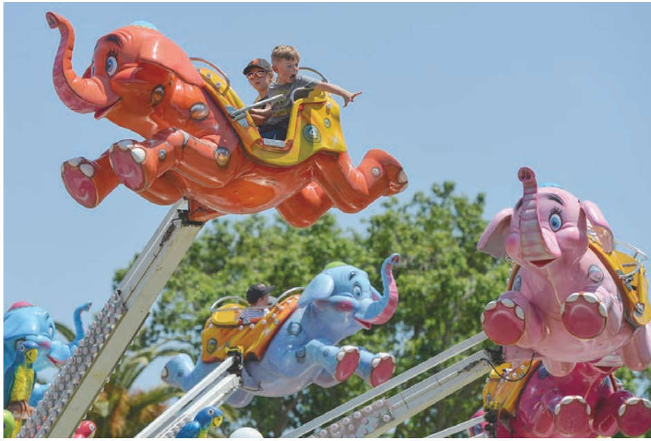
Youngsters and the young at heart enjoy a turn on the flying Dumbo ride during opening weekend of the Alameda County Fair. [See photo gallery at www.independentnews.com/multimedia ]