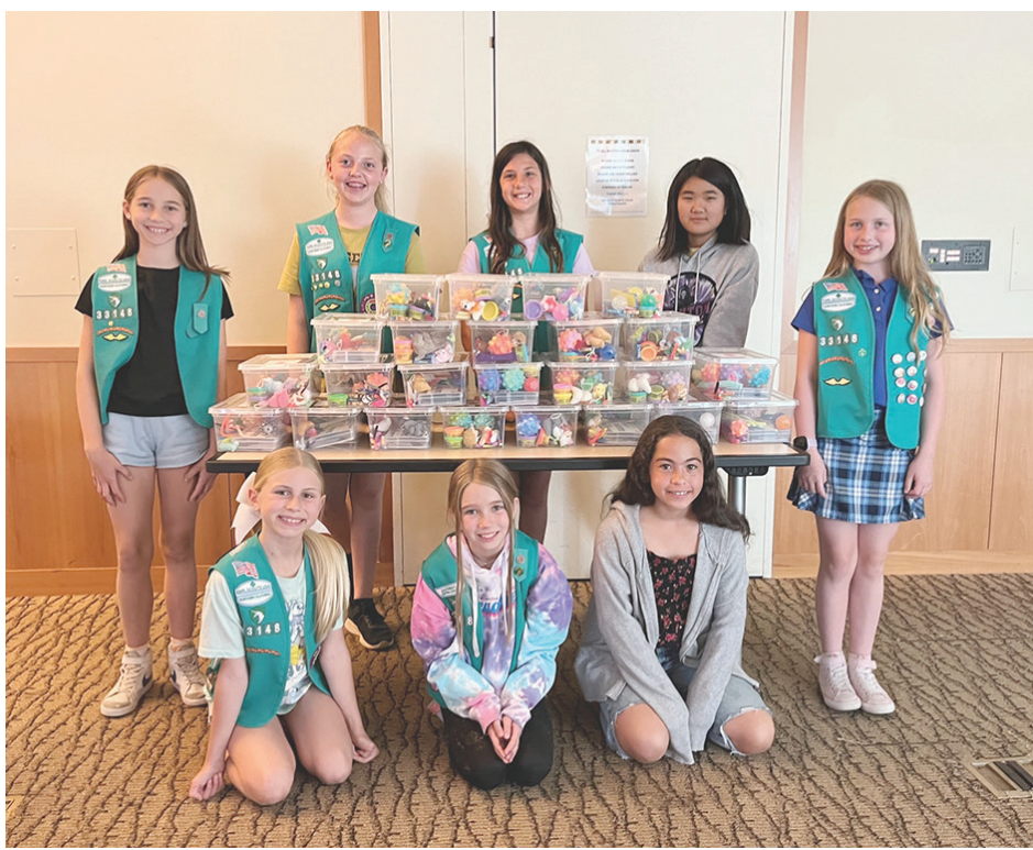
Livermore's Junior Girl Scouts from Troop 33148 have just completed their Bronze Award Project. The girls researched which tools would be beneficial to support social emotional learning. They then created Calm Down Kits that were distributed to four Livermore elementary schools.