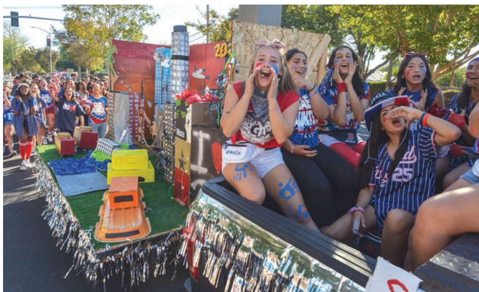
Students make their way down Village Parkway during Dublin High School's annual homecoming parade on Friday, Sept. 30. Each class presented its own float during the event, which was led by Dublin High cheerleaders and the Dublin High School Marching Band. Dublin middle and elementary school also participated in the celebration. [See photo gallery at www.independentnews.com/multimedia ]

That job, Newsom said, belongs to the California (See BEES, page 3)