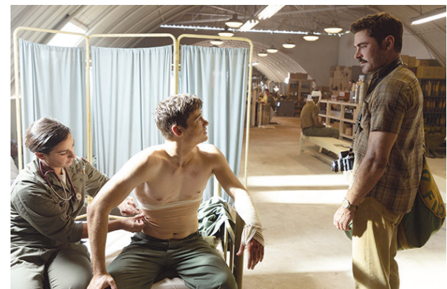
Livermore native and actor Kyle Allen, center, is starring opposite Zac Efron in a supporting role in the recently released movie "The Greatest Beer Run Ever."