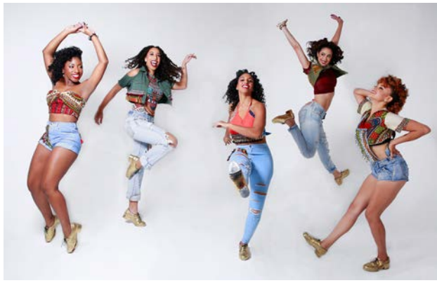
The Syncopated Ladies, a female tap dance group from Los Angeles will perform at the Bankhead Theater on Oct. 12.

Tickets are available at livermorearts.org, by calling 925-373-6800, or at the Bankhead Theater box office at 2400 First St., Livermore.