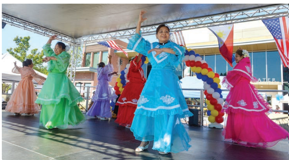
A celebration of Philippine culture and heritage took place at the Bankhead Plaza on Sunday, Oct. 2. Hosted by the Livermore Valley Arts Center, Las Positas College and the Livermore Filipino-American Organization, the event was designed to promote, preserve and embrace the Philippine culture. [See photo gallery at www.independentnews.com/multimedia ]