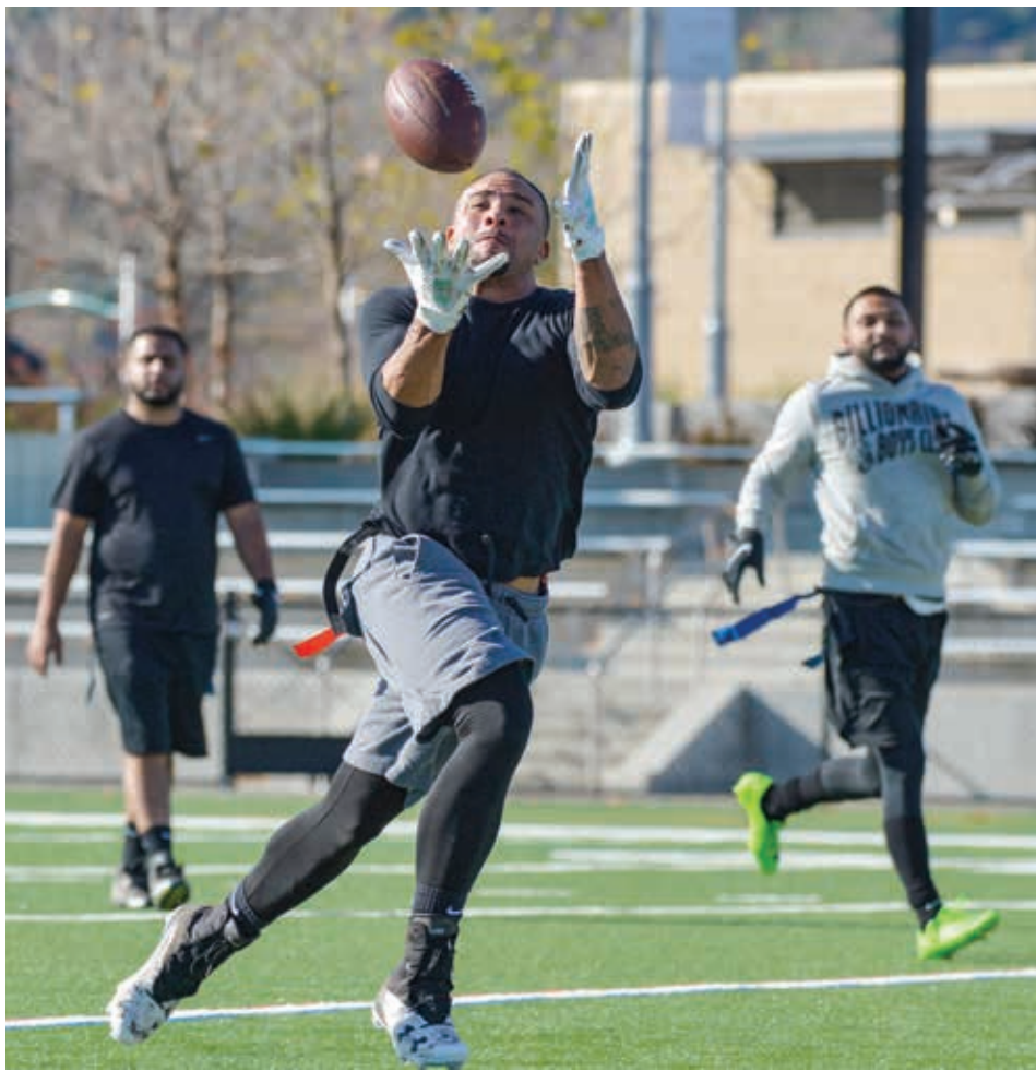
A group of friends from the East Bay play flag football on Sunday, Dec. 27, at the Bernal Community Park sports field in Pleasanton.