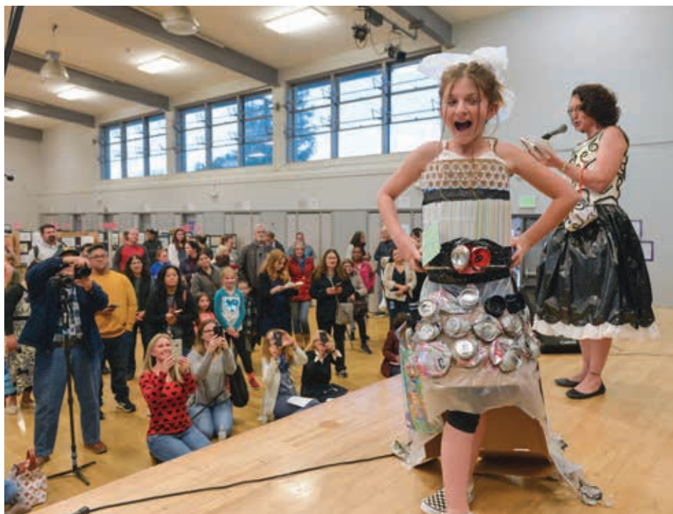
Young scientists in the Livermore Valley Joint Unified School District shared their research and innovation at the Junction Avenue K-8 School during the 20th Annual Science Odyssey Feb. 13 "Trashion" show. The show featured an eco-friendly fashion contest.