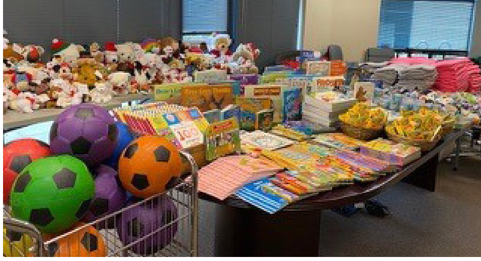
Rotarians distributed 125 gifts to children in Livermore.

Christmas came in a different package this year for youngsters from the local Head Start program.