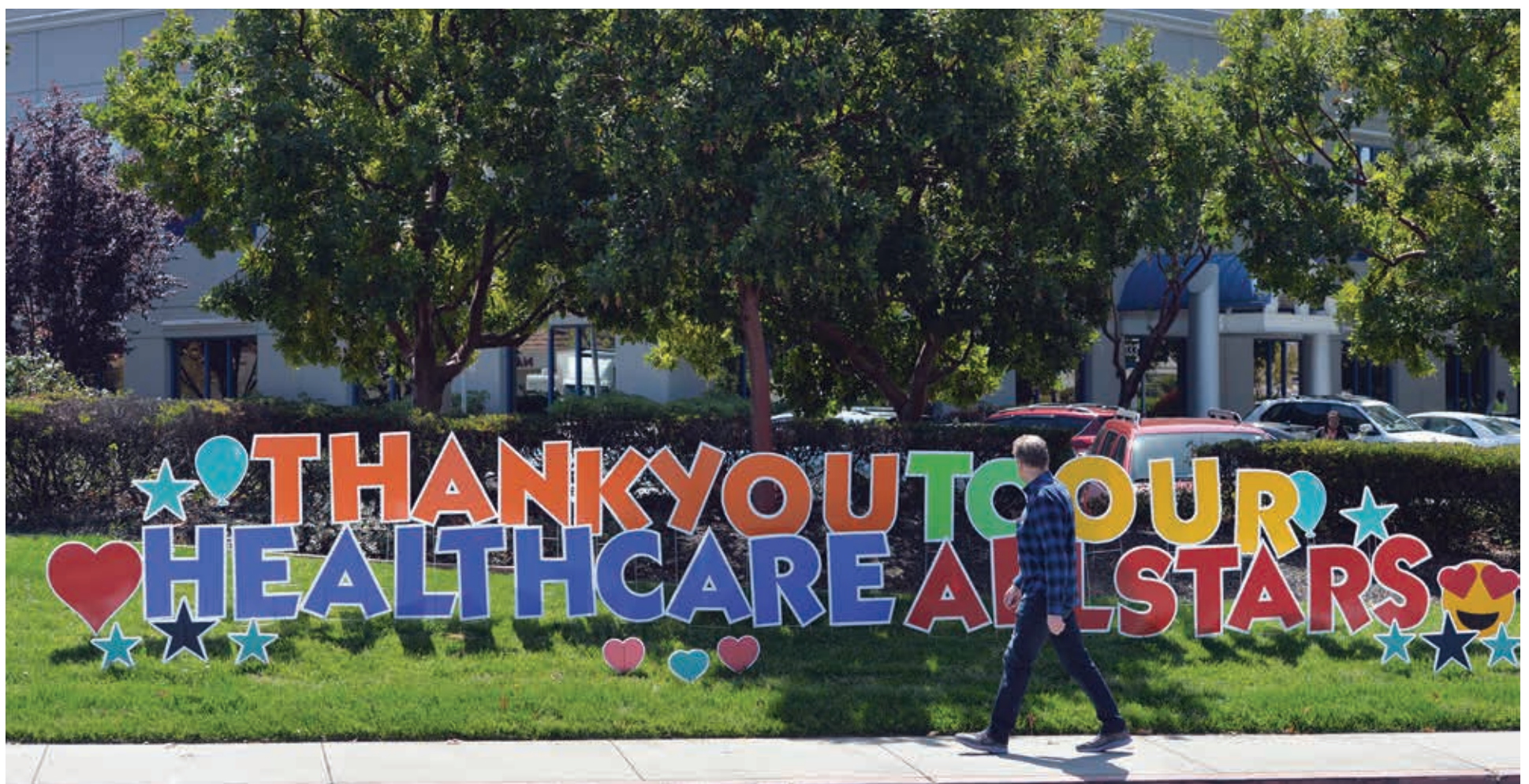
A large sign cropped up on April 13 in Livermore in front of Stanford Health ValleyCare, thanking health care workers for their service during the COVID-19 crisis.