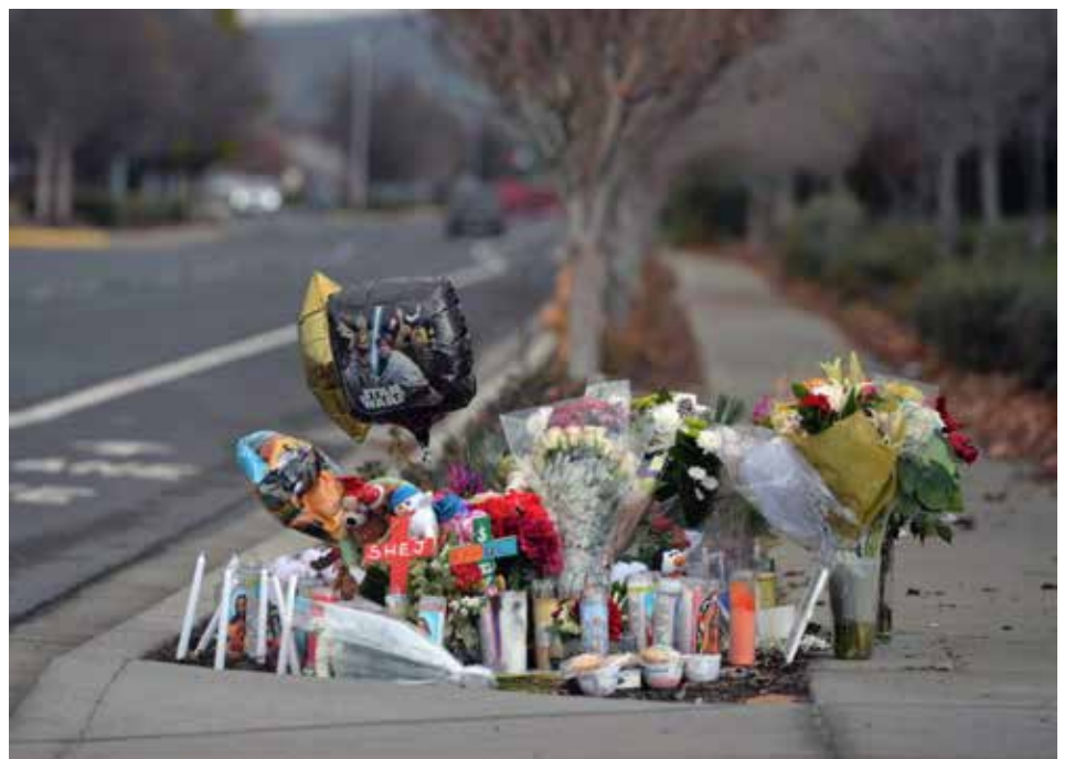
A roadside memorial at the 5600 block of Las Positas Road in Livermore was set up at the site of a fatal accident that claimed the lives of three teenagers on Dec. 22.

Griffith said she hired (See CRASH, page 10)