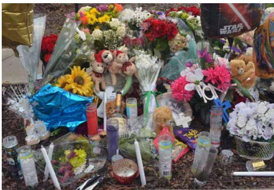
The community of Livermore paid tribute to three young men who were killed in a car crash on their way home from work last week.