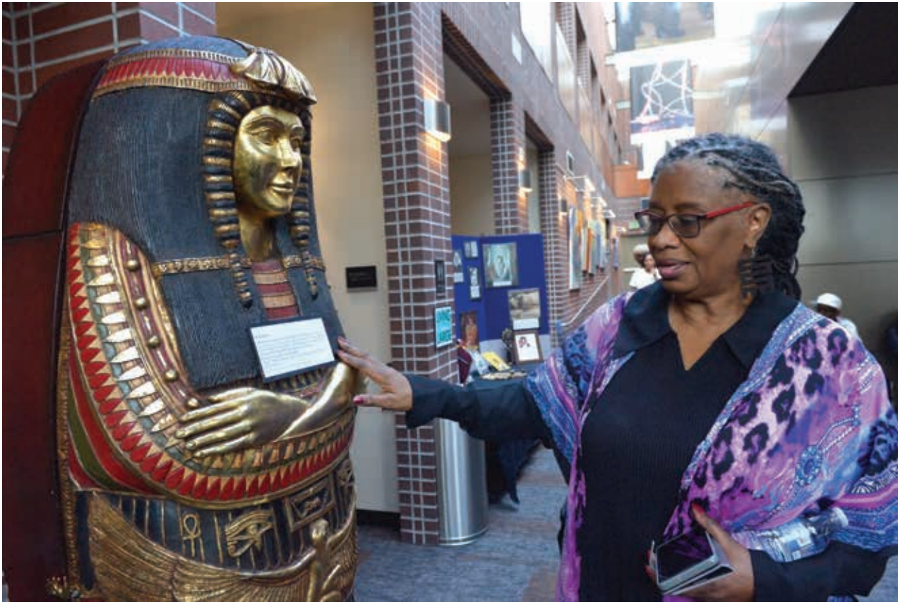
An African American Cultural Celebration was hosted by the Livermore Valley Performing Arts Center in the Bankhead lobby and plaza on Saturday, Jan. 11.