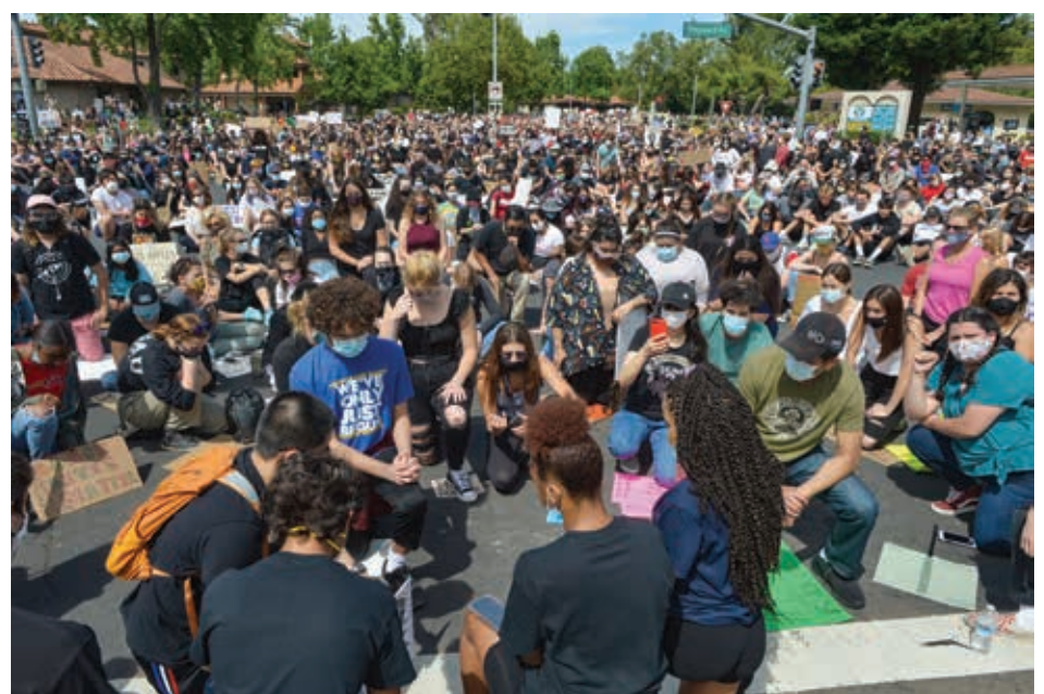
On June 5, protesters paused at the intersection of Valley Avenue and Hopyard Road in Pleasanton for 8 minutes and 46 seconds of silence – the amount of time that a Minneapolis police officer knelt on George Floyd's neck.