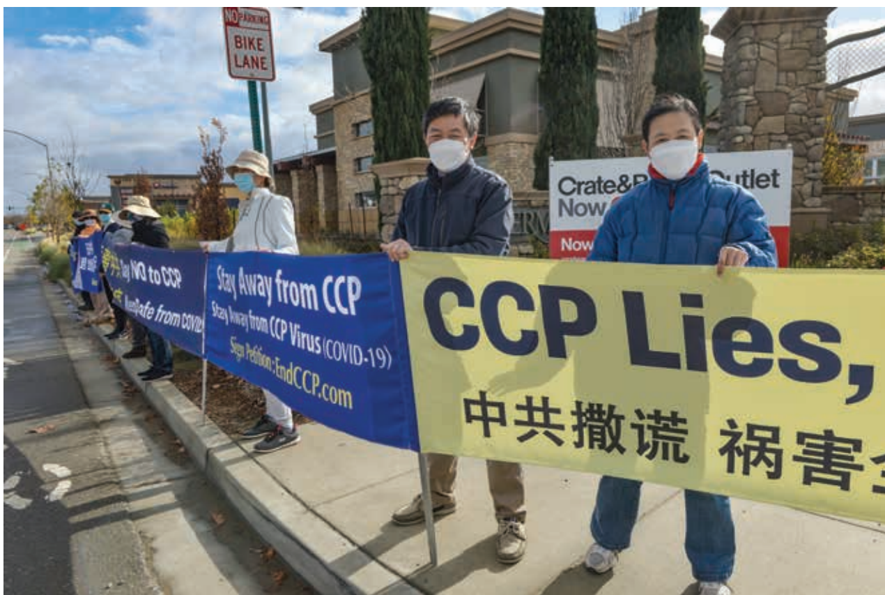
A group of Chinese immigrants protest the policies of the Chinese Communist Party at a staged demonstration by the San Francisco Premium Outlets in Livermore, on the corner of El Charro Road and West Las Positas Road, on Saturday, Dec. 26.