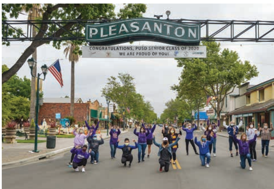
Parents and administrators from the Pleasanton Unified School District placed ribbons up and down Main Street on May 20 to celebrate the graduating Class of 2020.