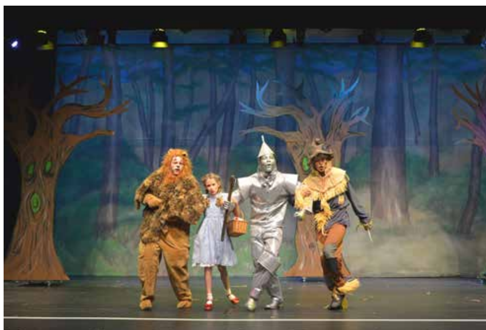
Left, the classic Wizard of Oz quartet graces the stage of the Bankhead Theater, while Dorothy, right, marvels at her ruby slippers. The Christian Youth Theater of the Tri-Valley, now permanent residents of the Bankhead, put on the Wizard of Oz production from June 13 to June 16.

“The Wizard of Oz” seemed a fitting work for CYT’s official residency debut, with its oft-repeated moral of the story, “There’s no place like home.” And now, thanks to the Bankhead Theater, CYT has found a permanent one.