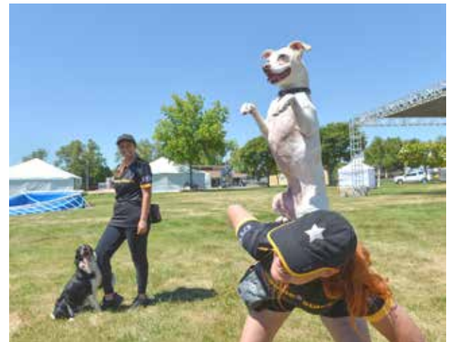
Dog-human teams of performers demonstrate the Canine Stars Stunt Dog Show, new to the Alameda County Fair this year. (See story on page 7.)