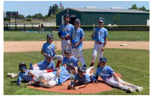
Granada Little League underdogs The Hooks win Tournament of Champions after a difficult season.

Danville 4-0 to advance to the Majors championship. The Orioles defeated Danville 10-0 in the opening round of the AAA bracket and followed up with a 7-4 win over Bollinger Canyon to advance to the championship.