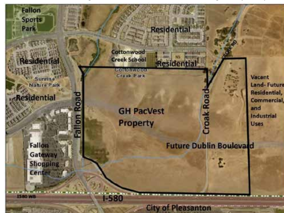
Applicants of the Dublin Fallon 580 project, the 192 acres north of Interstate 580 and east of Fallon Road, are asking for several land use changes for more affordable housing and a public park.

the future Dublin Boulevard Extension within Dublin's city limits.