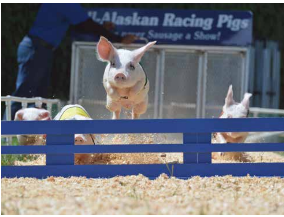
The Alameda County Fair opened on June 14, heralding the Tri-Valley summer with its assortment of rides, food, events and shows. Above, the Alaskan Racing Pigs vie for first place around their track. Below, new, creative versions of fair cuisine, such as the SPAM “fries,” tempt fairgoers as they explore. Some 500,000 people are expected to visit before the fair closes on July 7.