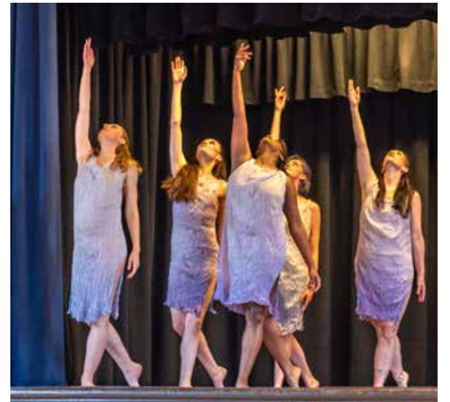
The RammDance dance company focuses on dances of empowerment, feminine strength and transformation.