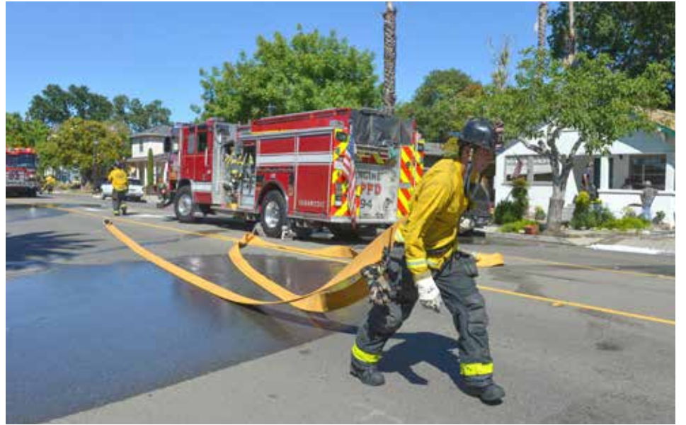
The Livermore Pleasanton Fire Department responds to a fire on Pleasanton's First Street on the afternoon of June 14. First Street was closed for about two hours to allow fire-crew and equipment access. The fire was confined to a garage, in which a vehicle caught fire.

Regarding the plan as a whole, Jeffress said, "The strategic plan doesn't stand alone in a vacuum. It's part of a process. It ties into the implementation planning, and it integrates with our budget process to sort of move through a continuous annual cycle in which we're constantly evaluating our priorities, updating our departmental work plans and implication priorities, and ensuring that those are aligned with our budget."