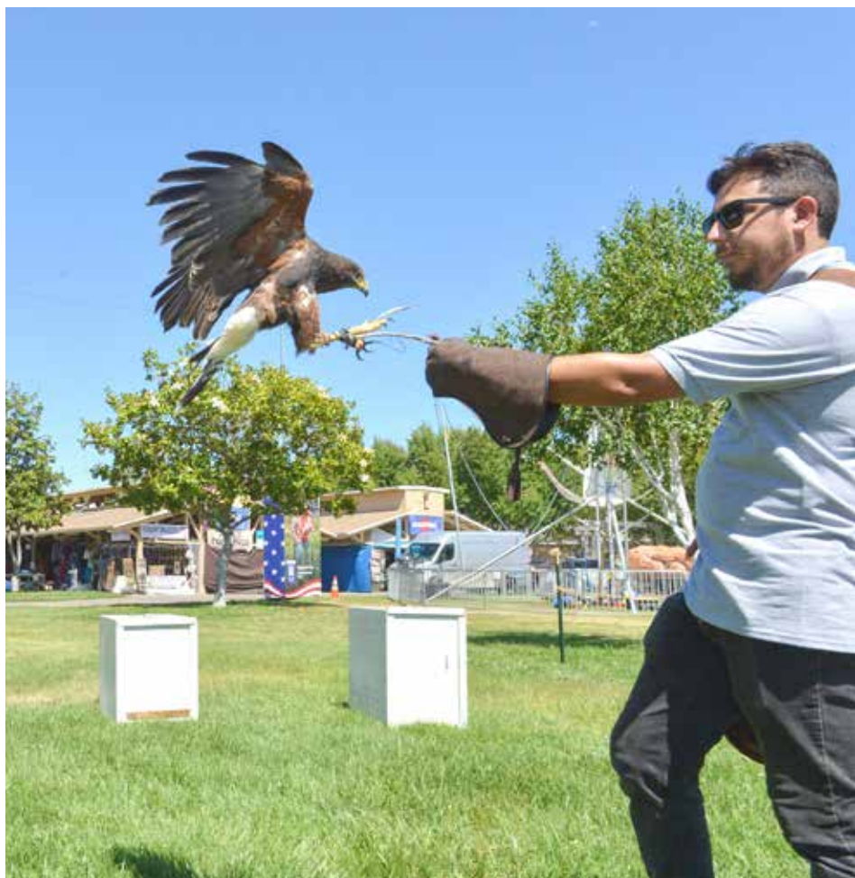
New this year to the Alameda County Fair is the Raptor Show, featuring falcons, hawks and owls in action.

For more information and updates, visit alamedacountyfair.com .