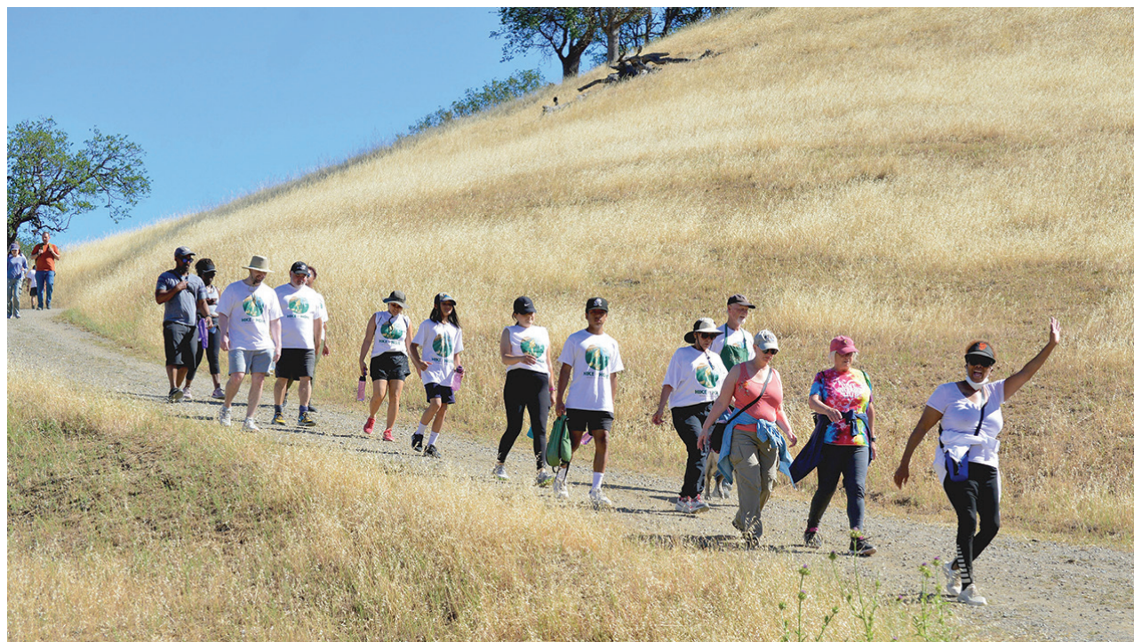
The May 14 Hike for Hope fundraiser at Del Valle Regional Park broke both attendance and fundraising records this year, raising over $180,000 for Hope Hospice patient care.