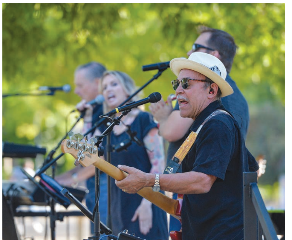
Retroactive performed during the Friday, June 10 Concert in the Park event at Lions Wayside Park in Pleasanton. Hosted by the Pleasanton Downtown Association, the Concerts in the Park series runs every Friday through the end of the summer. [See photo gallery at www.independentnews.com/multimedia ]