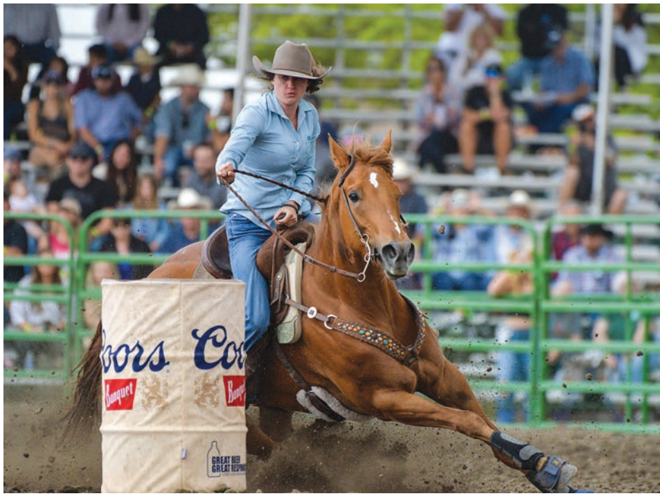
A horse and rider make their way around barrels at the Livermore Stockmen's Rodeo on Sunday June 12. The 104th annual event was hosted by the Stockmen's Rodeo Association and drew record crowds over the two-day event. [See photo gallery at www.independentnews.com/multimedia ]