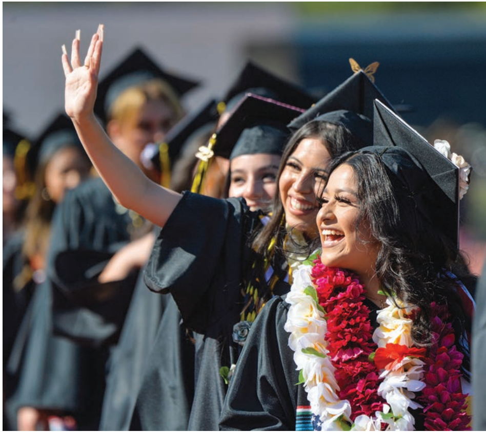
Warm temperatures didn't dampen the spirits of these Granada High School seniors as they celebrated the school's 56th commencement ceremony on Friday, June 10 in Livermore. [See photo gallery at www.independentnews.com/multimedia ]