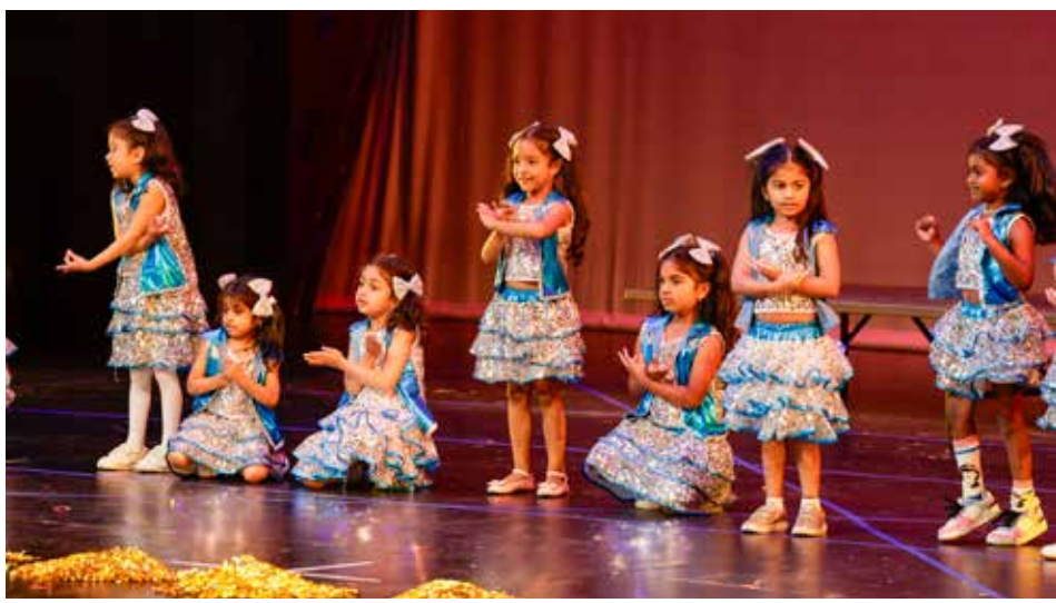
Even the littlest dancers get in on the fun as they take center stage during the BollyDhoom 2026 showcase. Held on Saturday, April 18, at the Mertes Center for the Arts at Las Positas College, and hosted by Bollywood for Life, the production featured a colorful array of traditional and contemporary high-energy routines.