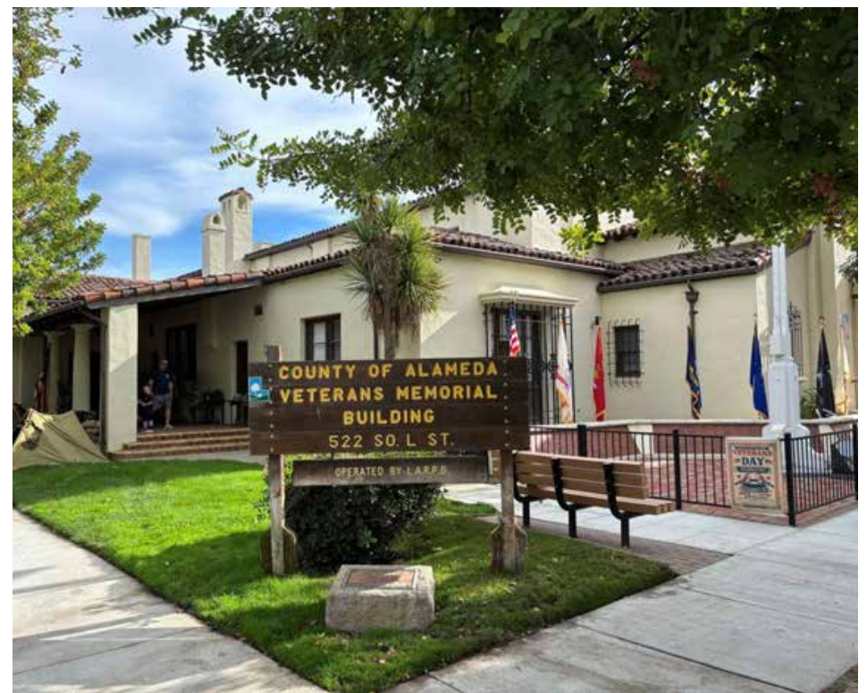
American Legion Post 47 observes the entire month of May as "Memorial Month." They will be at the Las Positas Walmart in Livermore the first three Mondays of May, 9 a.m. — 1 p.m., distributing poppies in remembrance of those who gave their lives.

On Memorial Day weekend, Saturday, May 23, through Monday, May 25, Post 47, will be placing flags on veterans' graves at the three cemeteries in Livermore.