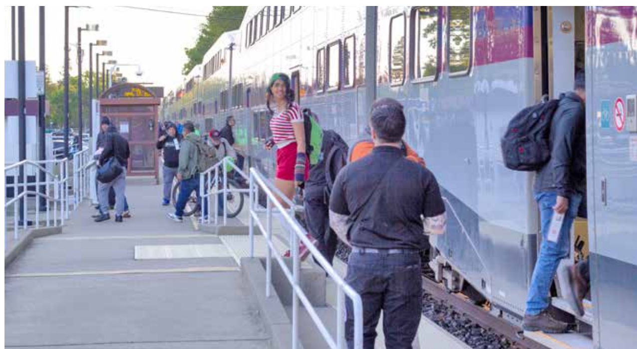
Commuters at the Pleasanton ACE station board and disembark a morning train. ACE will serve as the only rail service in the Tri-Valley if BART goes ahead with its proposed station closures.

spur line to Union City to connect with the BART station there. Although Ahmed said the news of the BART closures have not changed those plans, the Union City connection remains in its early planning stages, with no connection to BART in the meantime.