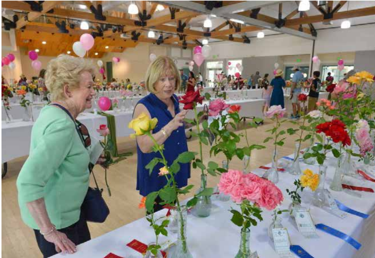
Two rose enthusiasts take in the sights at the 84th annual Pleasanton Rose Show held at the Pleasanton Senior Center on Mother's Day weekend in 2024. This year's event, on Saturday, May 9, enters a new chapter as it moves to its new home in downtown Pleasanton at the Museum on Main.

No prior entry forms are required, and volunteers will provide vases for single-stem entries. For more information, visit pleasantonroseshow.com .