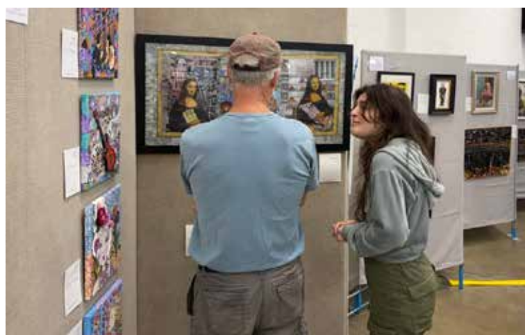
The Tri-Valley came out in full force for art and conversation at last weekend's Livermore Art Association Spring Art Show. Held at the Bothwell Arts Center, the annual exhibition serves as a vital hub for the community, bringing artists and residents together to explore creative expression and shared dialogue.