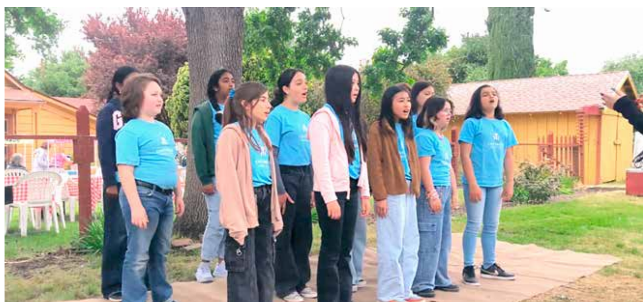
The Livermore Heritage Guild will host a Mad Hatter's Tea Party at Hagemann Ranch from 1 p.m. to 5 p.m. on Sunday, April 26, featuring performances by the Cantabella Children's Chorus. In addition to tea parties every half hour, the Sunday's at Hagemann Ranch program will include games of croquet and chess the way Alice played them. Alice in Wonderland-themed costumes are encouraged. Hagemann Ranch is a 19th century farmstead located at 455 Olivina Ave., Livermore, and managed by the Livermore Heritage Guild. The ranch includes a farmhouse, blacksmith shop and antique tractors. The family-friendly Mad Hatter's Tea Party is free and open to the public.