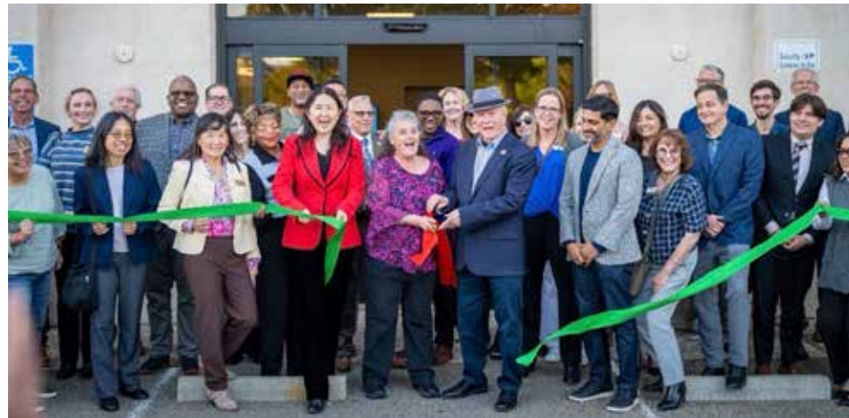
Senator McNerney (center, in hat) and his wife (to his left) celebrate the grand opening of the new Dublin district office alongside local leaders and community officials during a ribbon-cutting ceremony on April 17.

McNerney was elected to the California State Senate in November 2024 after serving 16 years in the U.S. House of Representatives. His 5th District includes the Tri-Valley area in Alameda County, as well as all of San Joaquin County.