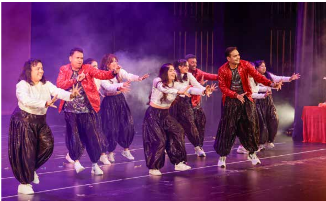
BollyDhoom 2026 performers light up the stage at the Mertes Center for the Arts at Las Positas College on Saturday, April 18. The annual showcase, hosted by Bollywood for Life, featured a vibrant mix of traditional fusion and modern high-energy dance, celebrating the Tri-Valley's diverse cultural arts community.