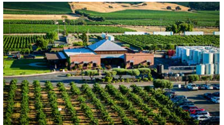
Concannon Vineyard announces a new 150-acre vineyard replanting project in the Livermore's Valley's historic winegrowing region. The low-interest loan is the second in our wine country issued by the Tri-Valley Conservancy as part of its Sponsored Replanting Program.