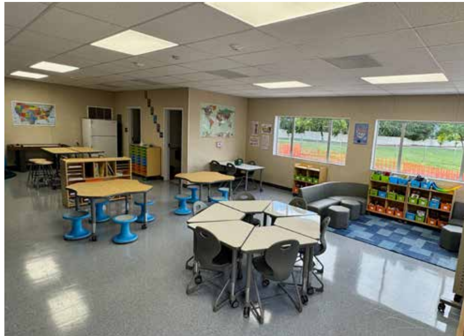
The new Kids Club facility at Fairlands Elementary School features dedicated areas for homework support and enrichment activities. The site, which opened in early April, added 50 new slots to the district’s before- and after-school care program to help meet rising demand.

one continuation high school and the Pleasanton Virtual Academy.