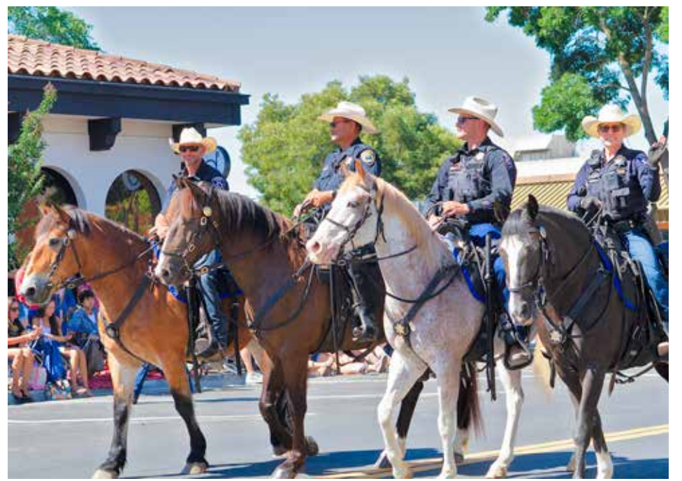
Livermore Mounted Police Cavalry lead the way at this year's Rodeo Parade. The annual event has been rolling through downtown since 1918, marking the 108th anniversary of the popular tradition.

Although the first Juneteenth celebrations took place as early as 1866, the day did not become a federal holiday until 2021.