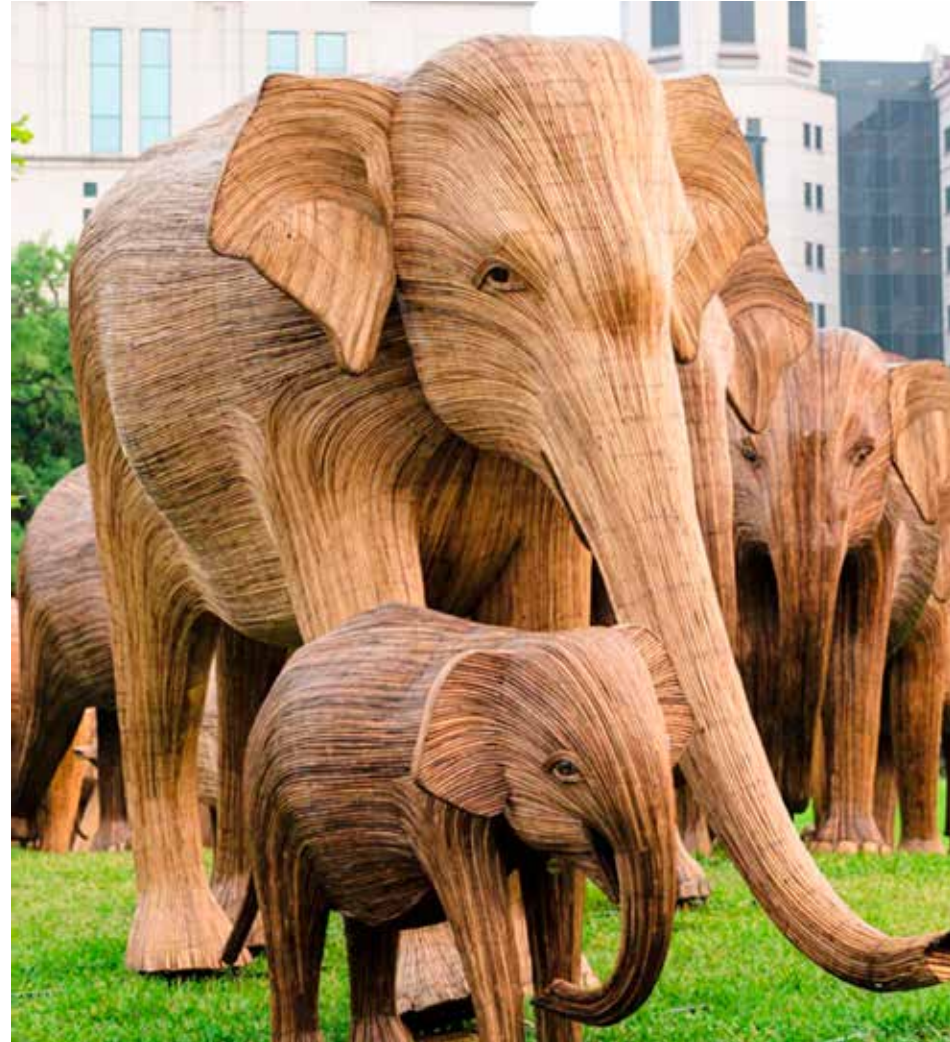
Crafted from dried lantana camara, an invasive weed harming Indian ecosystems, these life-sized elephants are part of a 30-member herd organizers hope to bring to Livermore’s Bankhead Plaza this fall.

undertaking — “The Great Elephant Migration,” slated for display throughout Livermore in September and October.