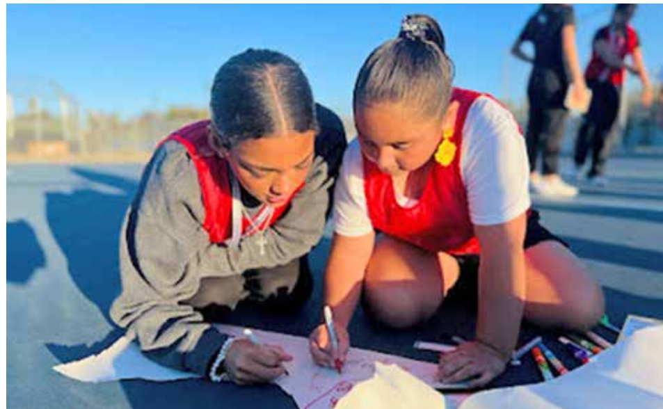
Participants work together on an interactive activity during a previous Girls Soccer Worldwide workshop. The organization's upcoming summer program, scheduled for June 29 through July 2 at Kellman Park in Livermore, will continue to use these hands-on exercises and teach core principles of confidence and compassion.

Families interested in learning more can visit girls-soccerworldwide.org .