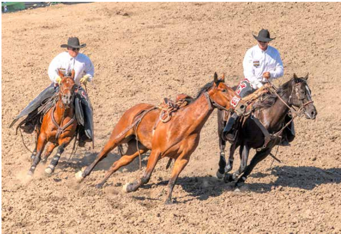
Two riders coordinate a seamless team roping run during the 108th annual Livermore Rodeo at the Robertson Park stadium on Sunday, June 14. The event brought fans of the "world's fastest rodeo" to the Tri-Valley this past weekend.