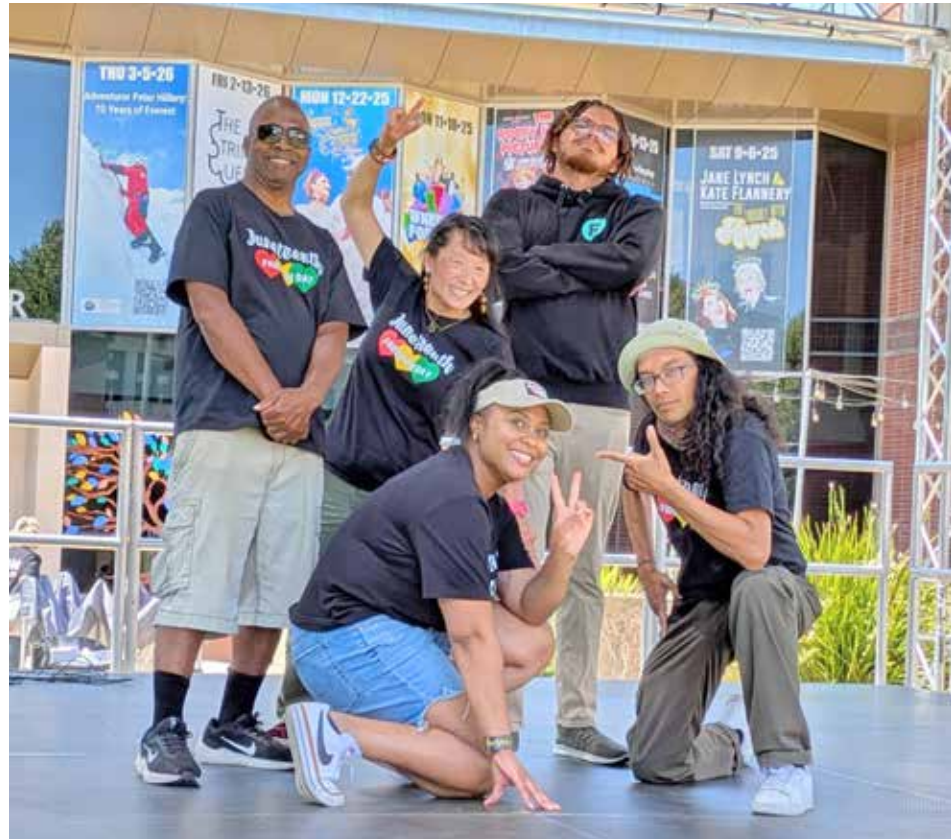
The sixth annual Tri-Valley Juneteenth Festival returns to the Bankhead Plaza in downtown Livermore this Saturday, June 20, from 10 a.m. to 2 p.m. Organized by Tri-Valley for Black Lives, the free community event will feature a headline performance by the Patton Leatha Band, alongside local artists, food, and family activities.