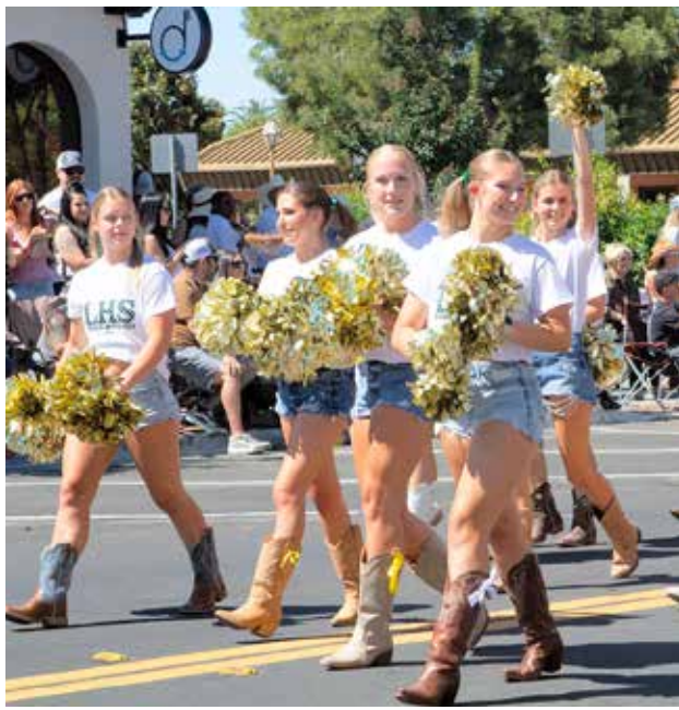
Keeping the 108-year tradition alive, the Livermore High School cheer squad showed up and showed out downtown for the annual Rodeo Parade on Saturday, June 13.