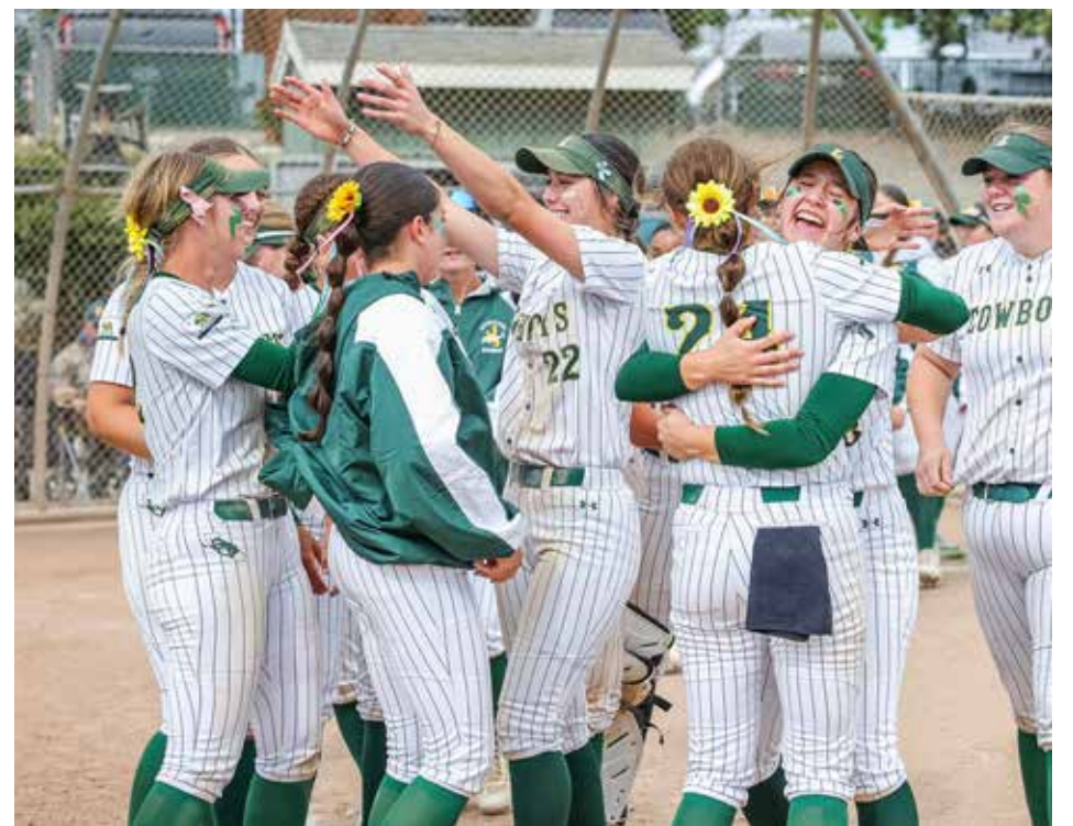
The Livermore High School softball team celebrates on the field after a 2-1 victory over St. Francis-Mountain View to win the 32nd annual Livermore Stampede on Saturday, April 11, 2026. The win moved the Cowboys to 15-1 and solidified their No. 1 ranking in Northern California.

The foundation is a Pleasanton-based nonprofit philanthropic organization that works to connect donors with community nonprofits in Alameda and Contra Costa counties. The Community Health Impact Grants are funded through the foundation's annual Power of Collaboration Corporate Challenge.