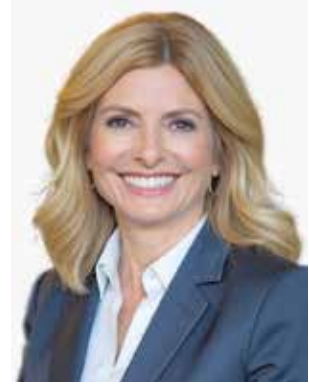
Attorney, Lisa Bloom

For more information and resources on sexual assault, there is a national network of community-based rape crisis centers and local organizations that support the needs of sexual assault survivors. For those in the Tri-Valley, Tri-Valley Haven serves adults and children who have experienced domestic violence, sexual assault or homelessness. Its 24-hour crisis line can be reached at 1-800-884-8119.