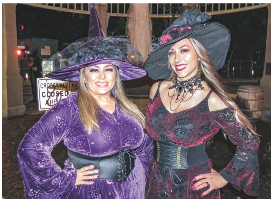
Livermore Downtown Inc. put on its annual Witches Night Out, Wednesday, Oct. 6. Attendees grabbed their brooms and headed downtown for a night of dinner, drinks and shopping. [See photo gallery at www.independentnews.com/multimedia ]