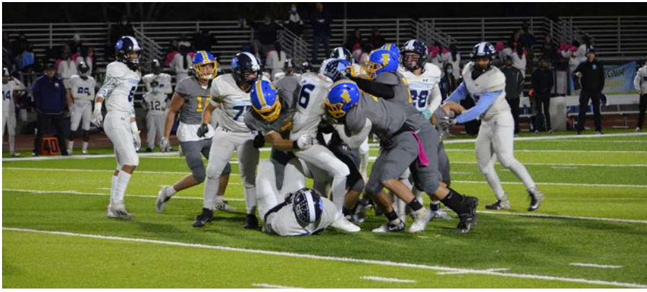
Despite going into the second quarter tied at 7-7, the Falcons hit a stride and didn't look back, winning 45-7 during Friday night's game.