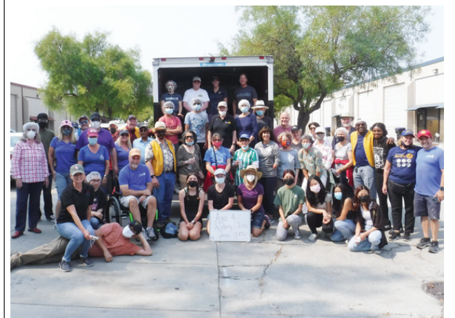
Volunteers from the Livermore Rotary Club, Livermore Valley Rotary Club, and seven other Rotary Clubs in Castro Valley, Dublin, Hayward, Pleasanton, and San Leandro gathered in Pleasanton to pack 37,897 meals for Kids Against Hunger, on Sept. 25.

The meals are vitamin fortified and include dehydrated vegetables, and the volunteers came from Rotary Clubs in Castro Valley, Dublin, Hayward, Livermore, Pleasanton, and San Leandro in support of Hunger Action Month. Kids Against Hunger, Bay Area is the regional office for Kids Against Hunger, a nonprofit organization based in Omaha, Nebraska. Area 4, Rotary District 5170 organized the volunteer packaging in support of Hunger Action Month.