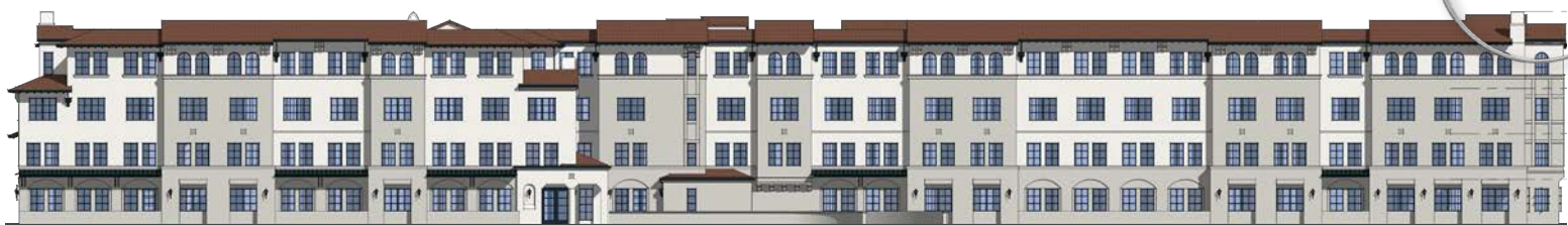
Future Eden Housing building stretching for a block along Railroad Avenue from L Street to the extension of K Street.

To protect our unique downtown, the Downtown Specific Plan limits site frontage involving height limitation on certain parcels. The City of Livermore has development rules that must be met by anyone who wants to build downtown. For site frontage, the rule states that a 4-story building is permitted on the site located south of Railroad Avenue, east of L Street – but only if the 4th floor does not extend more than 60% of the site frontage along L Street, Railroad Avenue, and South Livermore Avenue.