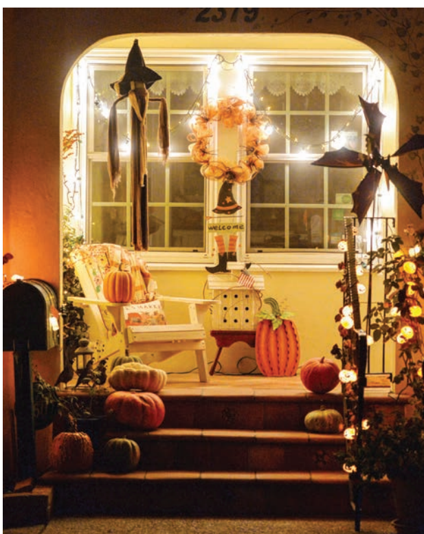
A Livermore home with twinkling fall decor brightens up the evening as days begin to shorten. Houses throughout the Tri-Valley have joined this resident in celebrating the onset of holidays and cooler California temps. [See photo gallery at www.independentnews.com/multimedia ]