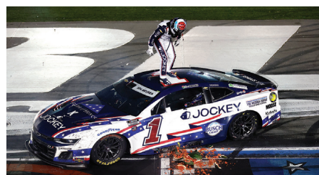
Ross Chastain celebrated by smashing a watermelon after winning the Coca-Cola 600 last May.