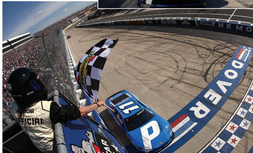
Denny Hamlin, driver of the #11 Progressive Insurance Toyota, takes the checkered flag to win the Cup Series All-Star Race at Dover Motor Speedway on Sunday.