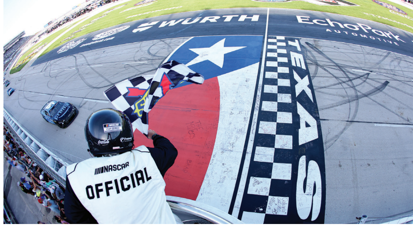
Chase Elliott, driver of the #9 Amazon Prime Chevrolet, takes the checkered flag to win the Cup Series Würth 400 presented by LIQUI MOLY at Texas Motor Speedway on Sunday.