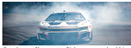
Road guru Shane van Gisbergen worked his way to a win last year at The Glen.