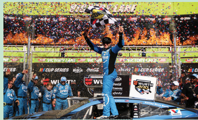
Chase Elliott in Victory Lane Sunday at Texas.

— Chase Elliott, who held off Denny Hamlin to win Sunday at Texas Motor Speedway