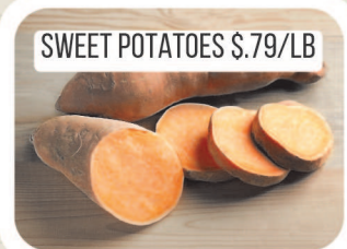
SWEET POTATOES $.79/LB