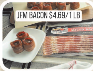
JFM BACON $4.69/1 LB