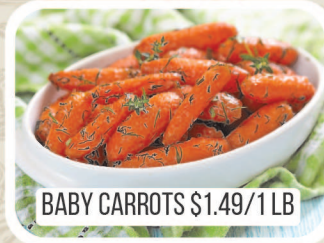
BABY CARROTS $1.49/1 LB