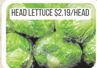
HEAD LETTUCE $2.19/HEAD