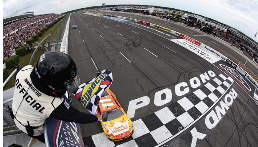
The checkered flag flies, and for the 64th time in his Cup Series career, Denny Hamlin wins, this time taking Sunday's Great American Getaway 400 at Pocono Raceway.