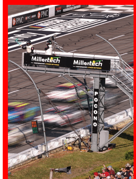
A general view of high-speed racing during Saturday's MillerTech Battery 250 presented by KOA at Pocono Raceway in Long Pond, Pennsylvania.