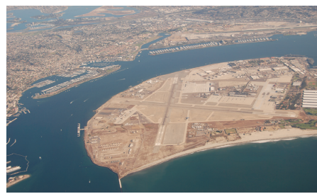
Aerial view of the Naval Air Station North Island at Naval Base Coronado San Diego.